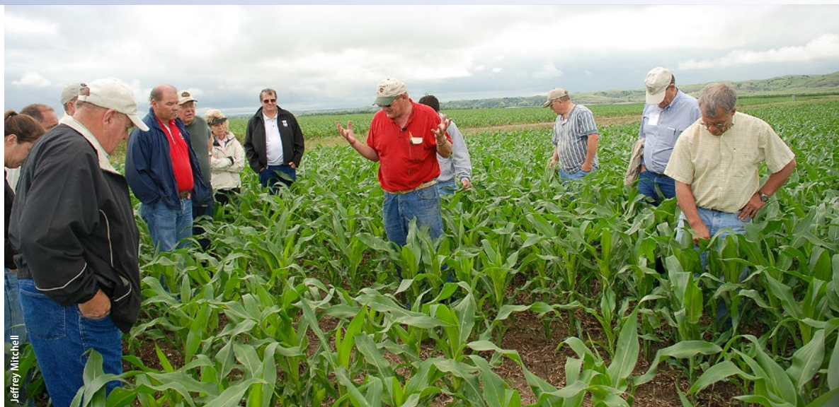
CASI farmers and members visited South Dakota, Nebraska and Colorado in 2006 to learn about conservation agriculture systems. Here, participants tour the Dakota Lakes Research Farm, a research and extension center of South Dakota State University, in Pierre.

There is a need for more cost-benefit data on conservation agriculture practices across a range of California crop systems. Research on ways to increase the amount of water in the soil that is transpired by crops rather than lost to evaporation could lead to water-saving farming methods. Experiments could help to determine how best to combine multiple conservation practices — for instance, reduced tillage, surface residue preservation and precision irrigation (see research article on pages 62–70 of this issue).