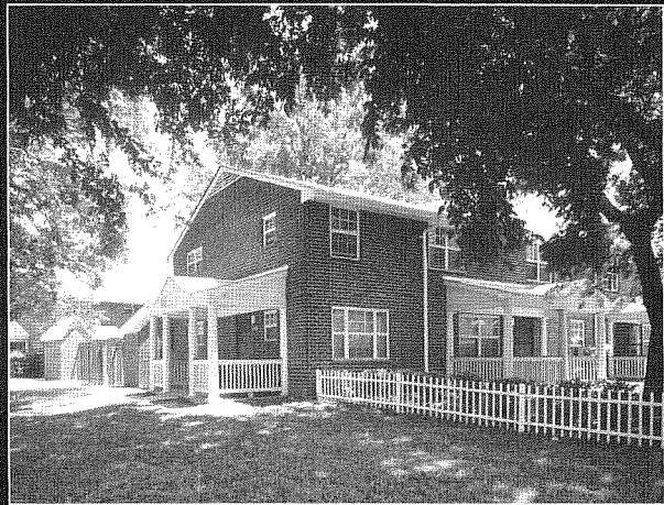
Diggs Town Place Design Award