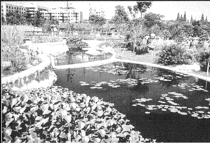
Living Water Park Place Design Award