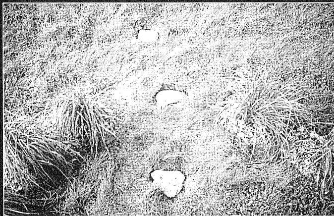
From Yard to Garden Place Research Award