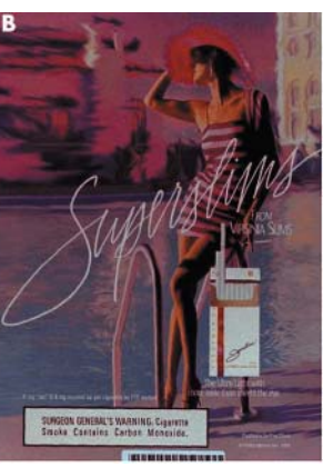
Figure 3 (A) Virginia Slims Superslims introductory 1990 advertisement emphasising the "less smoke" benefit with side-by-side cigarette comparison. 218 (B) Virginia Slims Superslims advertisement in 1991. "Less smoke" benefit has been eliminated. 219

acknowledge and even openly admit this, but, as it relates to their outward smoking image and personality, may prefer not to smoke a cigarette that blatantly brands itself as a solution to an odor problem.<sup>96</sup>