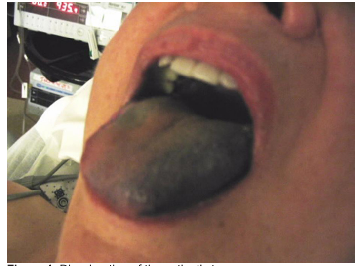
Figure 1. Discoloration of the patient's tongue

The patient arrived in the intensive care unit at our facility approximately five hours after placement of the FT-LMA. The anesthesia team was consulted for endotracheal intubation and removal of the FT-LMA. An initial oral exam revealed edema and marked purple-black discoloration of the tongue. Fiberoptic bronchoscope (FOB) exam through the FT-LMA demonstrated marked edema of all glottic structures. After unsuccessful attempts to intubate the patient with FOB-assistance through the FT-LMA, a bedside tracheostomy was performed by the surgical service. The FT-LMA was then removed and the oropharnyx inspected, revealing the entire length of tongue (from tip to base) to be swollen, markedly