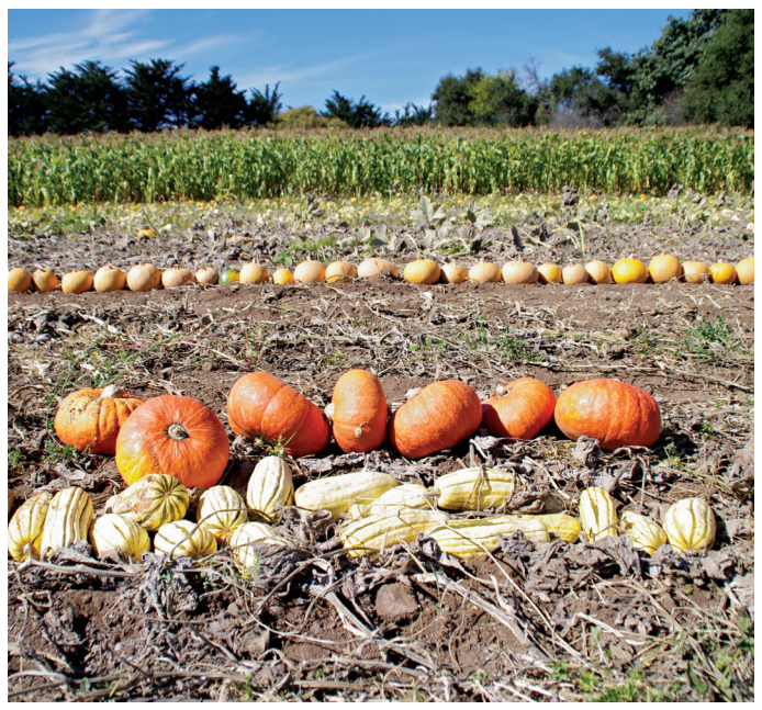
FIGURE 7. Windrowed winter squash curing at the UCSC Farm.

Because squash requires minimal tractor and foot traffic on moist ground during the cropping cycle, the soil should be easy to work following harvest. Typically the winter squash field will only need mowing and one or two passes with a disc to adequately prepare the ground for planting. Optimal soil conditions support good cover crop stands and rainwater infiltration rates.