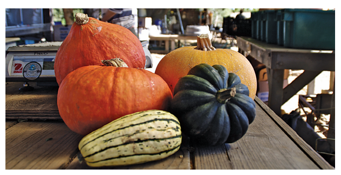
Clockwise from top left: Red Kuri, Winter Luxury (pumpkin), Sweet Reba, Zeppelin, Sunshine.

NOTE that some varieties are resistant to powdery mildew, a major disease of winter squash. When you search seed catalogs, look for the abbreviations "PMT" for Powdery Mildew Tolerant.