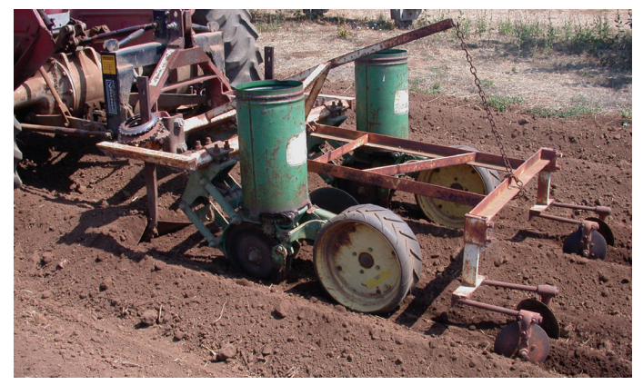
FIGURE 2. John Deere 71 "flexi" planter.

adequate seedbed preparation (allowing for thorough cover crop residue decomposition), soil moisture (adequate for germination), and optimal soil temperature (>60°F).