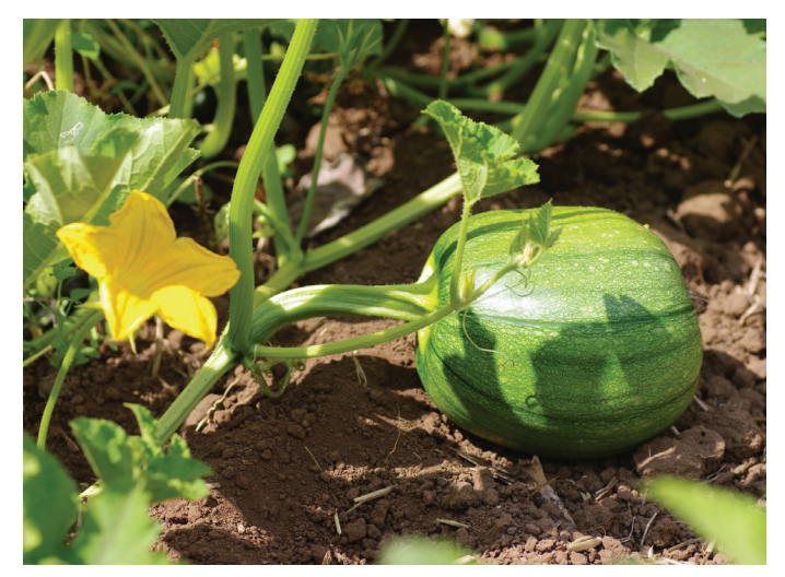
FIGURE 6. The squash canopy shades out weeds as fruit develops.

Winter squash commonly show signs of wilting on hot afternoons. This is not always related to lack of available water, so don't use the afternoon wilt symptom as a guide for irrigation frequency. If the plants appear wilted in the morning, then the plants are water stressed and you need to irrigate.