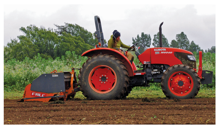
FIGURE 1. A spader can be used to incorporate cover crops.

In general, winter squash can be planted from mid-May through June on California's Central Coast. Shorter-maturing varieties can be planted in early July. Planting dates are based on timing of