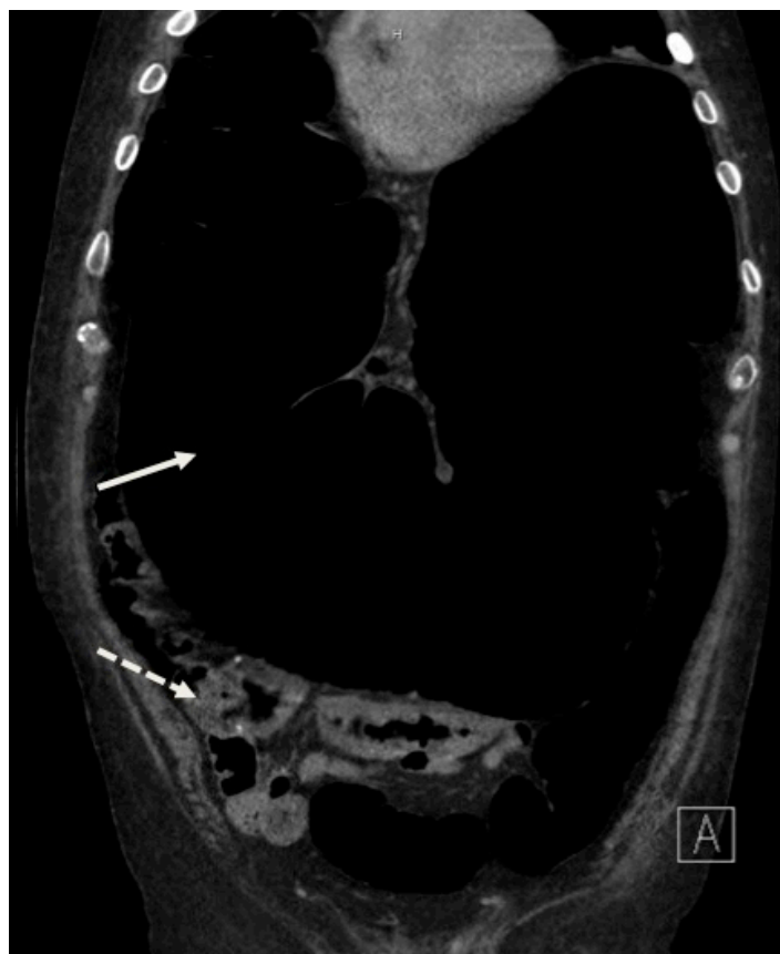
Figure 1. Dilated bowel (solid arrow) compressing the left atrium and lungs. Dilated colon contains stool and gas (dashed arrow).

Our patient's vital signs normalized and his distension improved with fluid resuscitation and nasogastric decompression.