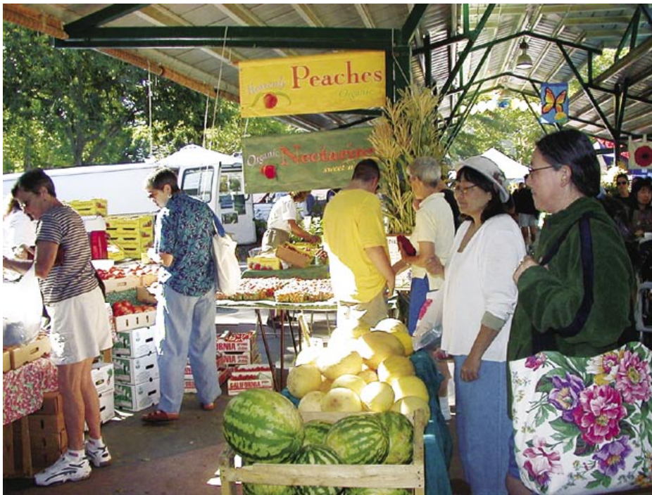
To encourage produce consumption among low-income consumers, the USDA could expand its Farmers' Market Nutrition Program, which provides $20 million in coupons annually to low-income and elderly persons for farmers' market purchases. Left , shoppers at the popular Davis Farmers Market.

probably have to be designed to minimize impacts to existing food assistance programs, depending on commodity distribution. For example, some commodities that currently qualify for direct payments — which eventually make their way to entities such as food banks and schools through FNS food distribution programs — could be negatively affected by a reduction in commodity availability and price.