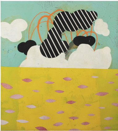
Fidalis Buehler White Cloud Caution Flasher Oil painting on panel 18 × 20 in.