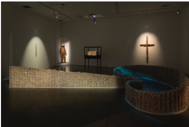
Chris Charteris Te ma (Fish trap) (installation view, in foreground), 2014 Ringed venus shells, nylon, wood 181 × 291 × 31.5 in. (4600 × 7400 × 800mm) Collection of the artist