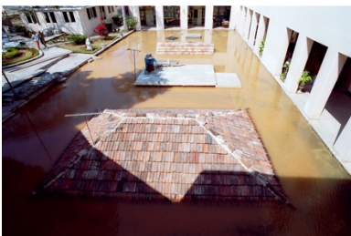
Humberto Díaz Espejismo, 2006 Sculptural installation, view of the piece in 9th Bienal de La Habana, Academia “San Alejandro,” Cuba