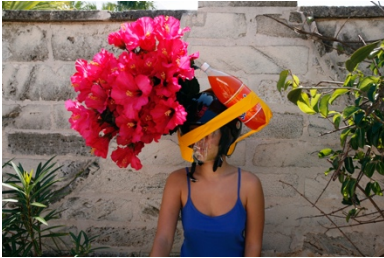
James Cooper Helmet Sculpture #1, 2010 Color photograph 40 × 30 in. (101.6 × 76.2 cm)