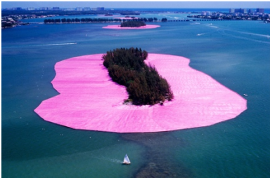
Christo and Jeanne-Claude Surrounded Islands, Greater Miami, Florida, 1980–83 Site-specific installation with polypropylene fabric