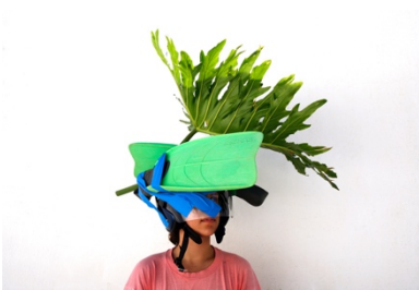
James Cooper Helmet Sculpture #3, 2010 Color photograph 40 × 30 in. (101.6 × 76.2 cm)