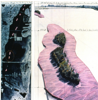
Christo Surrounded Islands (Project for Biscayne Bay, Greater Miami, Florida) , 1981 Collage in two parts, pencil, charcoal, pastel, wax crayon, enamel paint, and aerial photograph ©Christo