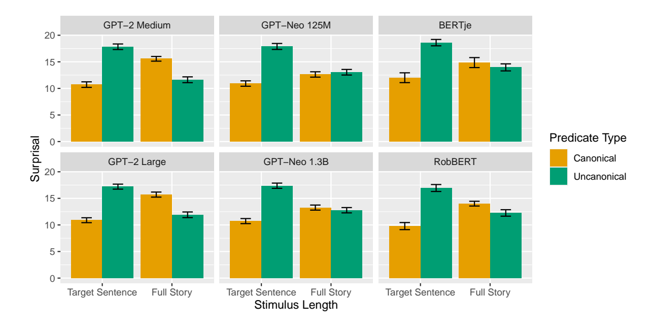
Figure 1: Surprisal elicited by critical words for each predicate type and stimulus length.

This is not the case for the remaining four language models: Dutch GPT-Neo 125M (Havinga, 2022b), Dutch GPT-Neo 1.3B (Havinga, 2022c), BERTje (de Vries et al., 2019), and RobBERT (Delobelle et al., 2020). However, these models do display the weaker reduction effect, and further, the absence of a significant difference between conditions for these models when presented with the full stories shows that the difference between canonical and noncanonical critical sentence stimuli is not just reduced, but disappears entirely.