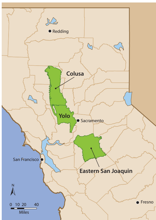
FIG. 1. Case study groundwater basins.

decision-making within the GSA or in coordination at the basin scale.