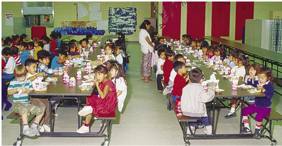
The Food Quality Protection Act reflects findings of a 1993 National Research Council report, Pesticides in the Diets of Infants and Children . The law requires an additional 10-fold safety factor on some pesticide tolerances to provide additional protection for young people.

less than 300,000 acres in production, which the EPA administrator determines do not provide sufficient economic incentive to support registration and for which there are no effective pesticide alternatives, or uses for which the available alternatives pose greater human risks. A pesticide can also receive minor-use status if it significantly aids in resistance management or improves IPM systems. The incentives may include an additional year of exclusive data use, waivers of certain data requirements and expeditious review that could bring the product to market sooner.