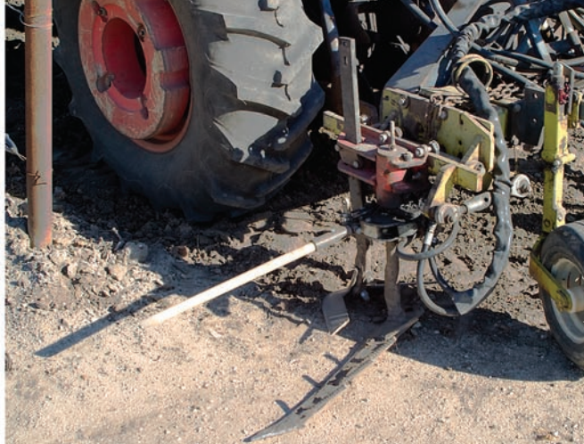
There were no differences in vine growth, crop yields or fruit composition among all the weed control treatments in the 5-year study, demonstrating that vineyard floors can be managed effectively without high-risk herbicides. For the cultivation treatment, above, the Radius Weeder inserts a knife into the soil to sever weed shoots from their roots.

cumulative cash costs, ranging from $899 to $1,032 per acre over the 4-year study period (fig. 2B). The preemergence treatment had the next highest cumulative cash costs, ranging from $555 to $690 per acre. The postemergence treatment was least expensive, at $498 to $633 per acre.