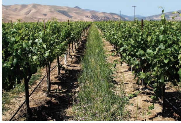
Vineyard floors are managed to prevent competition from vegetation that can inhibit grape yields and quality. Top, cultivated bare ground in the row middle; bottom, a cover crop.

herbicide use, mechanical weed control and cover-cropping (Elmore et al. 1997; Ingels et al. 1998). These practices, used alone or in combination, must be considered carefully because they have both direct and indirect costs as well as production implications for wine grapes. A grower's selection of vineyard floor management practices is based on numerous factors including production philosophy, terrain, soil type, irrigation system, economics, risk management, and environmental and regulatory pressures.