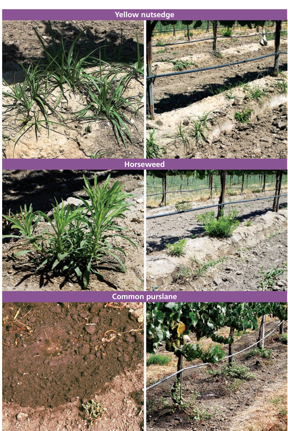
To assess the effectiveness of various vineyard floor management strategies, the authors compared pre- and post-emergence herbicide treatments with cultivation in the rows, and several different cover crops in the middle. The primary weeds in the Monterey County vineyard were yellow nutsedge, horseweed and common purslane.

^{\circ} Values within a column followed by the same letter are not different (Fisher's protected LSD test, \alpha = 0.05).