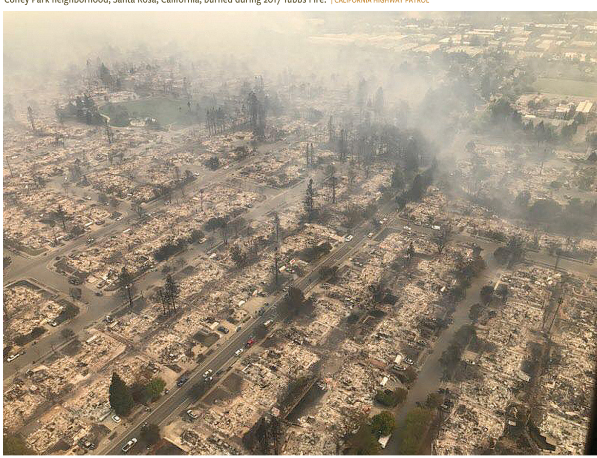
Coffey Park neighborhood, Santa Rosa, California, burned during 2017 Tubbs Fire.

The goal to mitigate risk aversion through shared participation can be achieved by developing interdisciplinary NPS teams, in addition to incident command team resource advisors, to manage these types of fires. In the 1970s and 1980s park natural resource managers were able to successfully manage prescribed fires and natural fires managed for