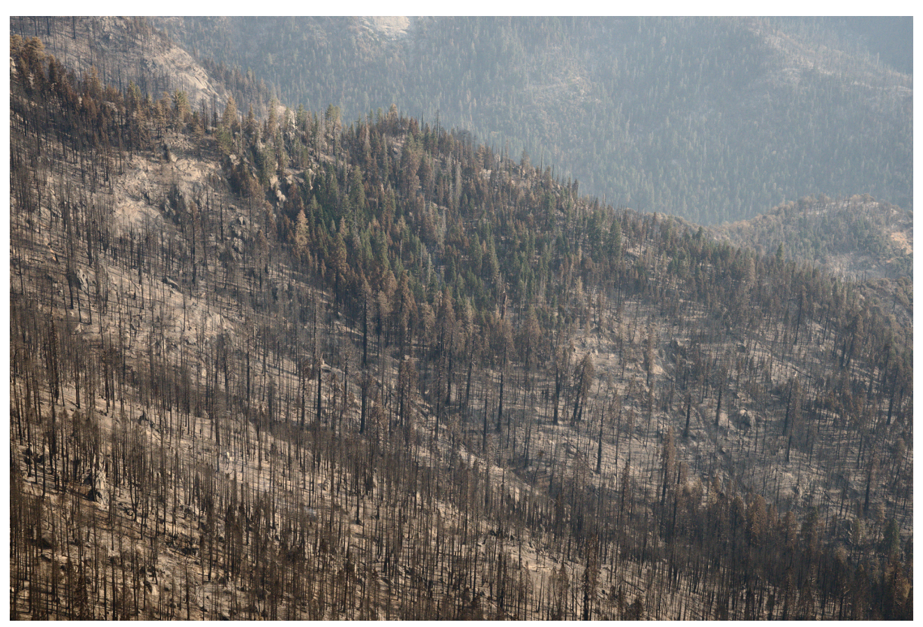
Giant sequoia groves burned during 2020 Castle Fire, Sequoia National Park

$1 billion for the federal fire management agencies. This increase greatly benefitted the wildland hazard fuels program and, for the first time, directed federal agencies to define the extent of wildfire threats to the Wildland Urban Interface (WUI, defined as up to 1.5 miles beyond the edge of developments) and develop programs to mitigate those threats. By 2006, the NPS hazard fuels budget rose to approximately $33 million. In contrast, the 1998 fuels budget was $7 million.