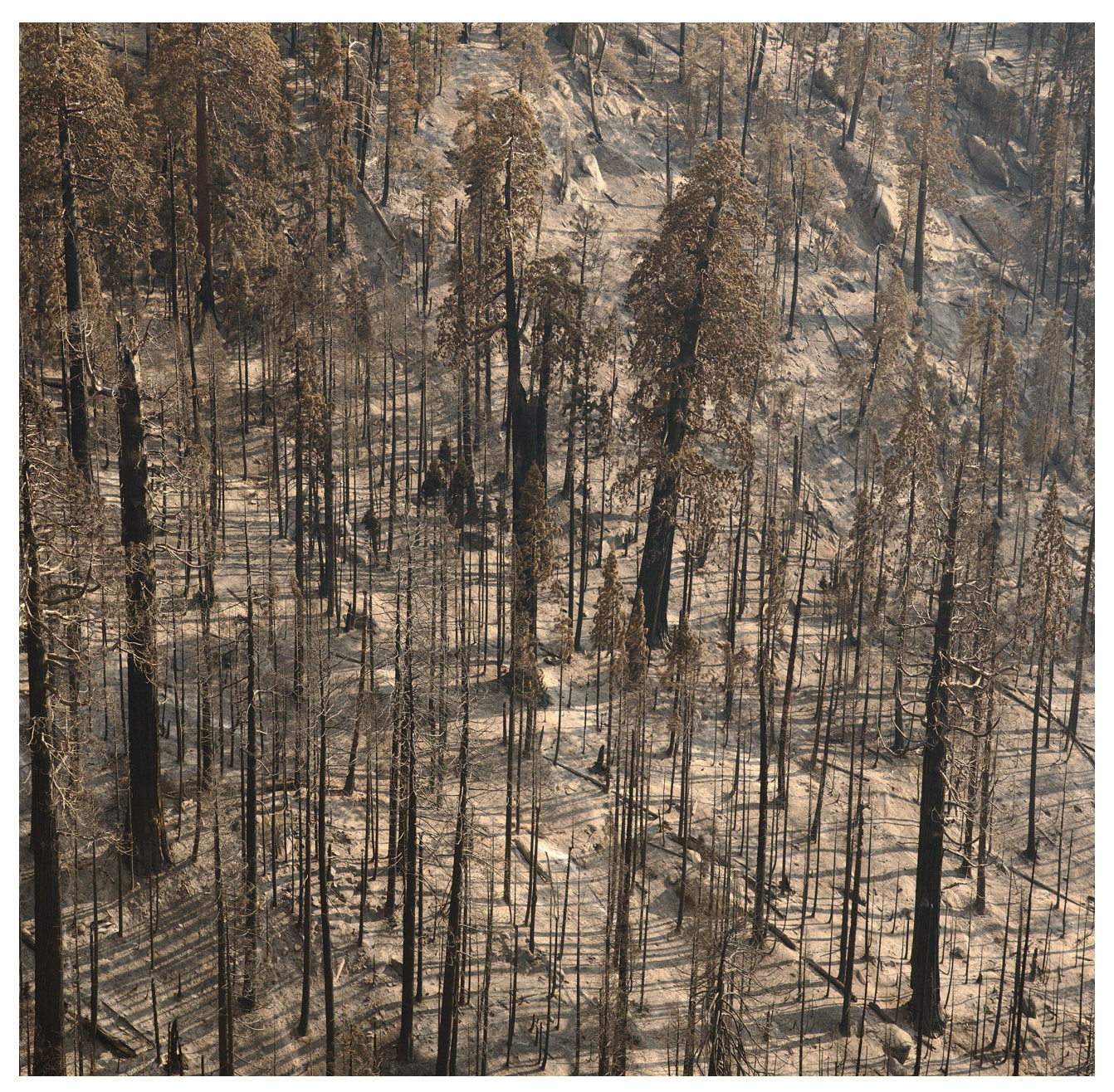
Giant sequoia groves burned during 2020 Castle Fire, Sequoia National Park

hundreds of thousands of acres of mixed conifer forests in national parks have burned by unnaturally intense wildfires, despite suppression efforts. Understanding the ecological impacts of these events, and incorporating this knowledge into revised fire program goals and objectives, will require the guiding hand of park resource managers and scientists.