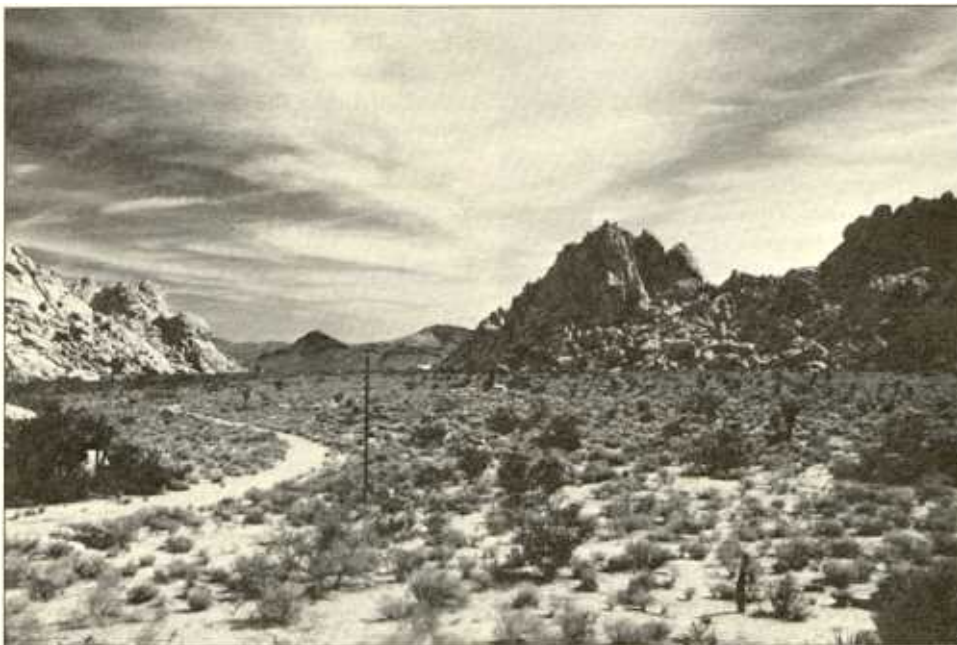
Looking east towards Van Winkle Mountain from the base of Granite Cove, the building site for Granite Mountain Reserve's recently funded laboratory and housing facilities.

Don't let your Transect subscription end! We're updating our mailing list. If you still wish to receive this newsletter, please complete and mail the enclosed postcard today.