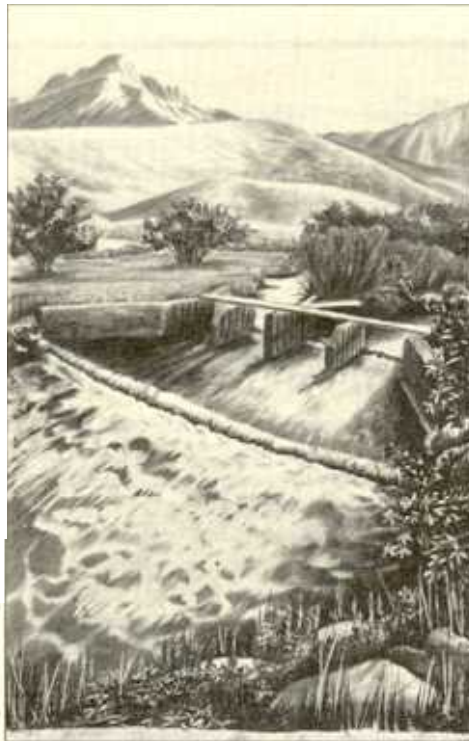
An existing field channel at SNARL, which recently received NSF funds to expand its experimental stream facilities on Convict Creek.