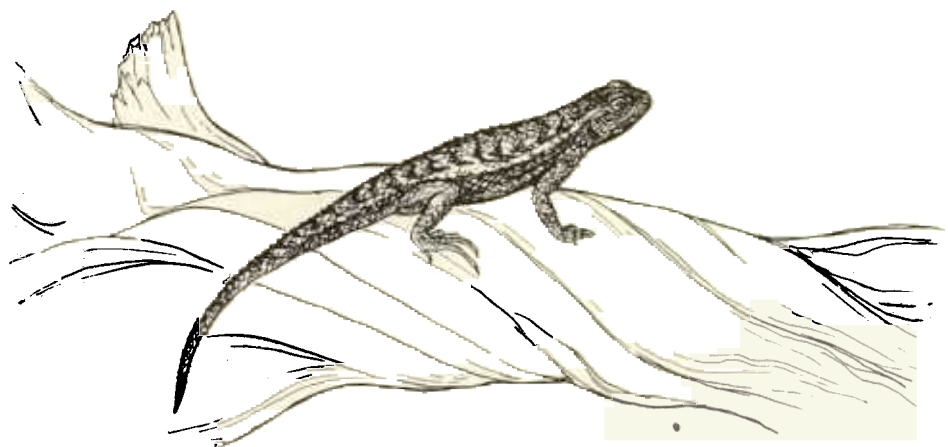
Western fence lizard, Sceloporus occidentalis , one of the organisms under study at NCCRP.