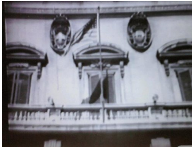
Screen capture of Palazzo Margherita from Talking to the Italians (1950).

The purpose of this documentary is to show you in brief how we handle this problem. 54