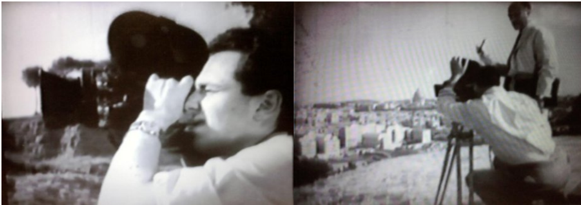
Italian cameramen at work on ECA productions as featured in Talking to the Italians (1950).

mobile recording devices in hand, as they interview the “stockholders” of Italy. Recognizably Italian faces are featured in close up in the foreground as iconic Italian architecture and landscapes fill the background of the frame. The words that the Italians can be heard speaking here, in their own language, are not translated for this film, suggesting an added air of authenticity for the intended American audience of this film. In short order the faces of the working men and women of Italy are replaced by images of the annual Fiera Milano (Milan Expo) – the largest industrial and commercial fair in all of Europe, which brought in hundreds of thousands of international visitors in 1950 alone to view and purchase the latest innovations in Italian commercial and industrial products and design. The audience also sees Italian filmmakers at work creating ERP films, as the narrator states that ECA estimates that every Italian viewed at least six ERP films in 1950 alone. This behind-the-scenes look at the production of Italian culture is intentional, and reinforces the MP message that the Italians are the agents of their own reconstruction.