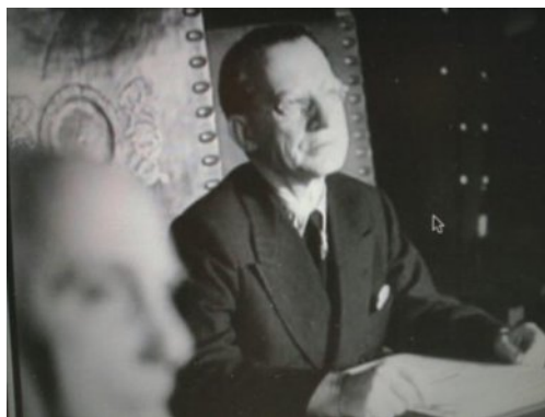
Prime Minister Alcide De Gasperi as featured in The Struggle for Men’s Minds (MSA, 1952)

By 1951, the Marshall Plan-sponsored reconstruction efforts in Italy had been underway for three years, and Prime Minister Alcide De Gasperi had been in power for six years. Understandably, the string of postwar and anti-Fascist governments had been wary of engaging in their own full-scale mass media propaganda campaign to help rebuild Italian morale. Thus from 1948 to 1951 the ECA Information Unit primarily waged this campaign for Italy. The resulting collaborations between US and Italian governmental and commercial interests tended to present Italians with ideas as absolutes, which coincidentally replicated the Fascist model of corporativism whereby