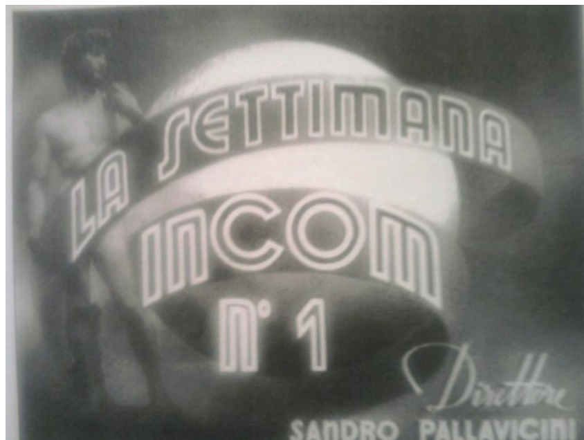
La Settimana INCOM logo: screen capture from opening credit sequence of episode No. 1, 1946.