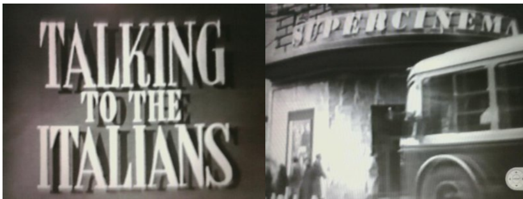
Two images from the ECA film Talking to the Italians (1950). The image on the left is the title slate for this ECA production, which reported on the Marshall Plan’s activities in Italy to Americans at home. The image on the right is a movie house in Rome, circa 1949. The film’s narrator informs the viewer that Italians are watching Marshall Plan films in theaters such as the “Super Cinema” pictured here.

A 1948 Act of Congress created a temporary US agency known as the Economic Cooperation Administration (ECA) to administer the economic and diplomatic concerns of the US