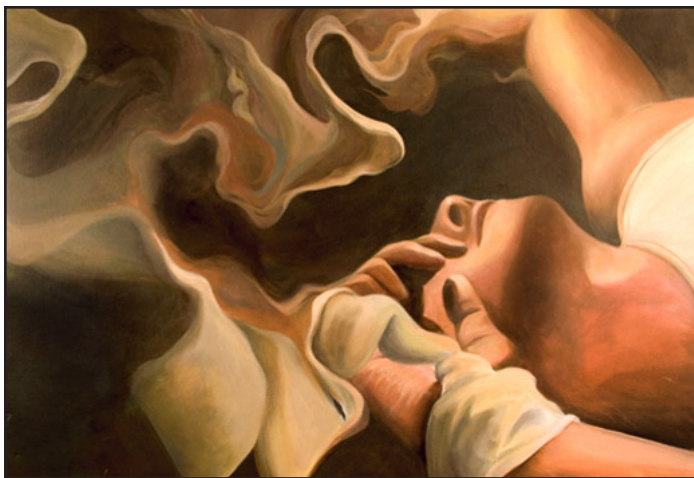
Figure 2. Chronic Fatigue Syndrome is typically long lived and the rate of recovery is as little as 5% of cases, usually consuming a patient's life

potentially tying together a body of research that is often at odds with itself in terms of reliable study results and replicability.