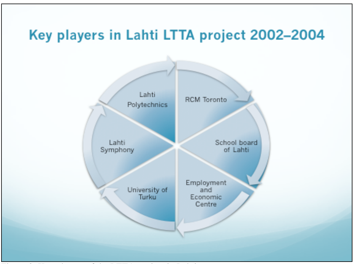
Figure 2. Key players of the LTTA-project in Lahti

When told about the idea of LTTA, the school board of Lahti was willing to give space for the Finnish–Canadian experiment and to pay the wages of substitute teachers who would be needed during the course. The actual training was to be based on two equally important modules: