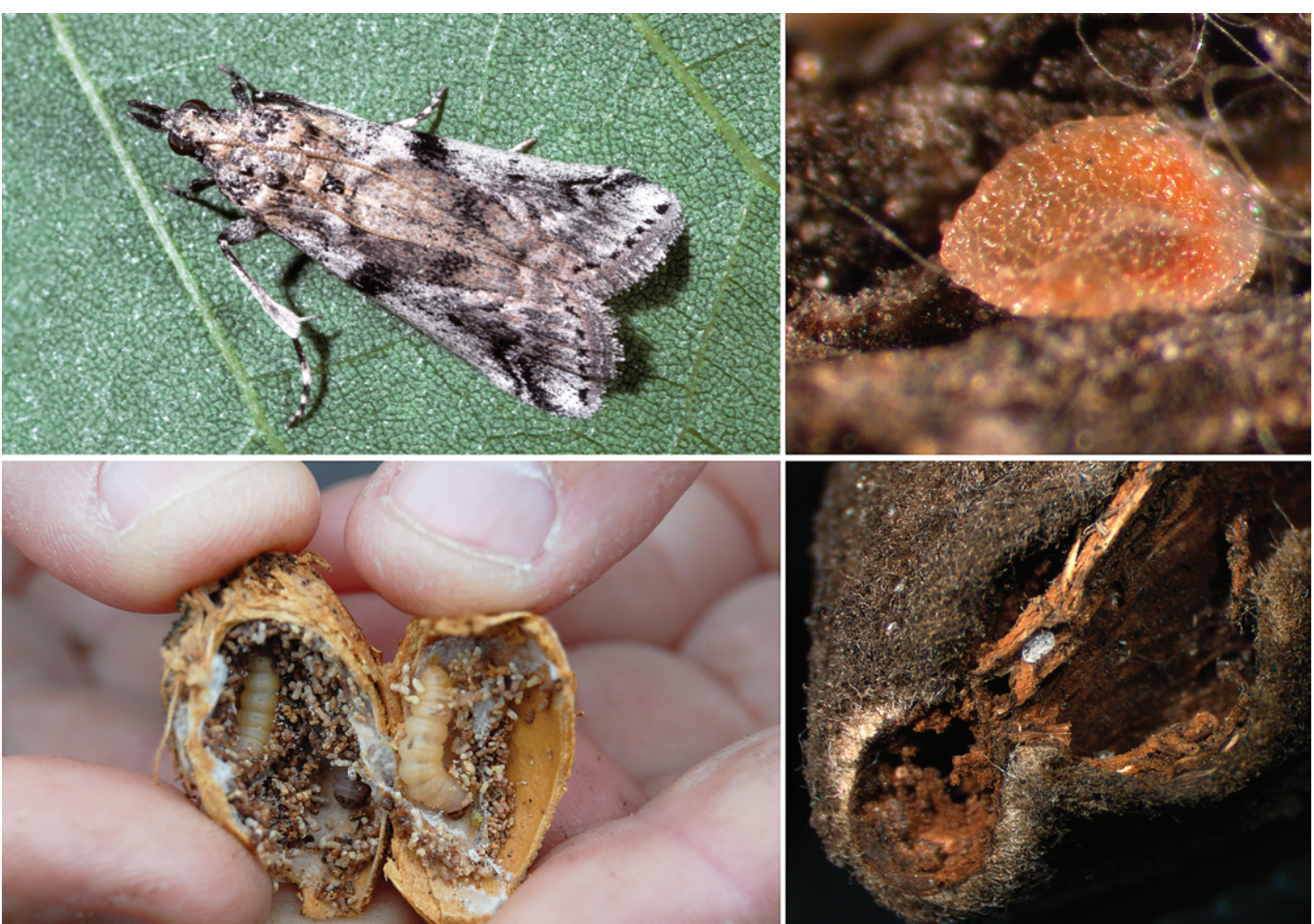
Navel orangeworm control can be achieved in almonds by careful orchard sanitation, early harvest of the 'Nonpareil' variety and postharvest fumigation with insecticides. Clockwise from top left: a navel orangeworm adult; a fertile navel orangeworm egg laid on a mummy almond; a hatched egg; and an almond mummy infested with navel orangeworm larvae.

damage goal for navel orangeworm has been 2% or less. Factors contributing to this current threshold include the crop's increased value and the association of kernel damage by navel orangeworm with aflatoxin contamination, a major quality concern (Schatzki and Ong 2001; ABC 2006). In addition, the European Union — the largest market for California almonds — has imposed more-stringent import standards that have lowered the allowable level of aflatoxin B1 to 2 parts per billion (OJEU 2007).