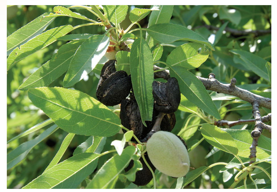
Sanitation practices in almond orchards can have a significant impact on insect pest damage. Almond "mummies" remaining on the tree after harvest provide overwintering sites for navel orangeworm, which then infests the new crop.

A lmond and pistachio plantings comprise more than 880,000 acres in the Central Valley (NASS 2006). Almonds account for about 83% and pistachios for about 17% of these plantings (730,000 and 153,000 acres, respectively). 'Nonpareil' is the most popular almond variety, comprising 37.7% of all standing acreage in 2006, and 'Kerman' com-