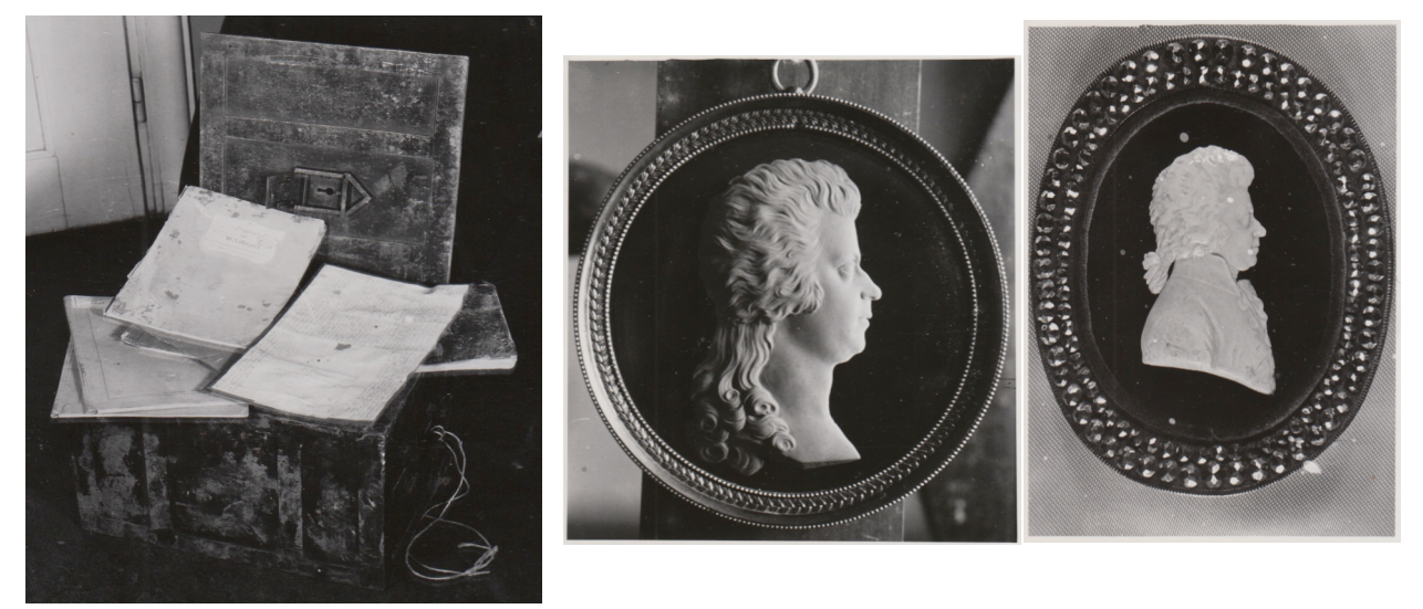
Left: Iron Box containing the most valuable objects from the Mozart Museum, discovered after the war with the lock broken and many objects missing. Center and Right: Two Still Missing Mozart Portraits stolen during, or immediately after World War II - Center: Leonard Posch, Wax relief, 1788; Right: After Leonard Posch, Meerschaum relief, c. 1790. Photo Credit: Internationale Stiftung Mozarteum Salzburg<sup>147</sup>

Item numbers 7-14 above were later found in the Salzburg Museum, having been stored together with that museum's holdings in the salt mine. The "twelve figurines, colored etchings of the first performance of the 'Magic Flute' at Leipzig, 1793" were also found, and Mozart's watch was returned in 1964, but was stolen from the museum in 1966. However, item numbers 1-6, and number 15, above remain missing today.<sup>148</sup>