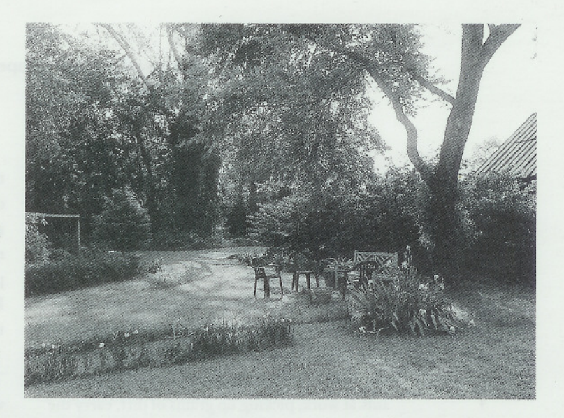
A part of the yard at Thorbiskope, the author's house in North Carolina

The horticultural downside is that some beloved local plants like azaleas do not do well