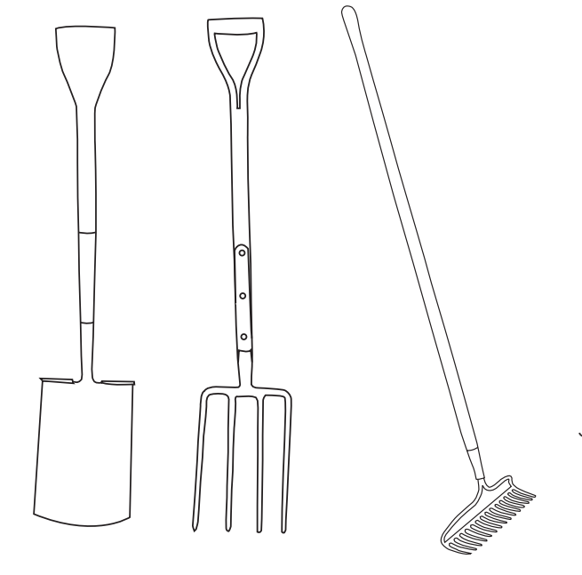
Tools of the trade: D-handle spade, tilthing fork, metal bow rake. Use the fork and rake to create appropriate surface tilth via tilthing and raking.

Cultivation adds air to the soil. The infusion of oxygen in soil air has a warming effect and promotes a microbial "bloom." The increased microbial population breaks down or oxidizes organic matter. In this process nutrients are released for plant uptake and growth. To a limited degree this is a good thing. In excess, it can degrade structure (excessive pulverization), destroy aggregates, reduce pore space, create surface crusting and erosion, and result in poor water- holding capacity and decreased biological life.