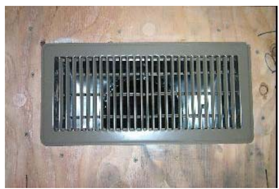
Figure 5. Example supply grille of multi-branch duct system in LBNL laboratory