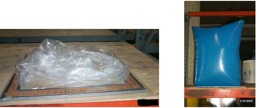
Figure 2. A clear bag before a measurement and a blue bag at the end of a measurement