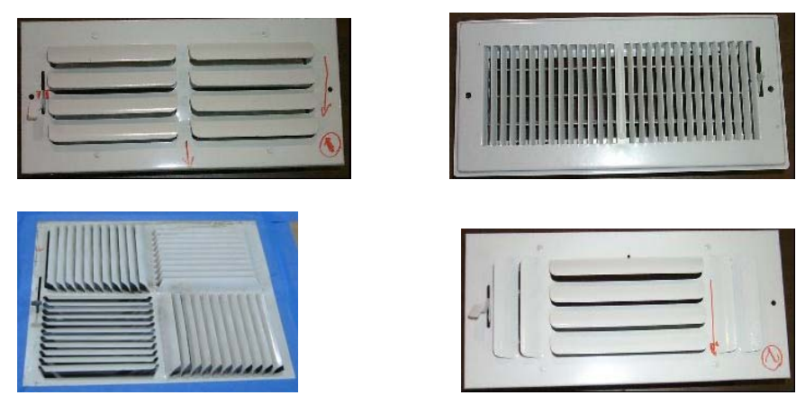
Figure 4. Examples of grilles used for single-branch calibration test apparatus. Clockwise from top left: one-way, two-way, three-way, and four-way throws.