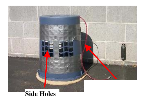
Figure 1 is an illustration of one of our prototype basket flow hoods. For use on commercial grilles, we added a commercially available flow capture hood to the inlet of the basket.