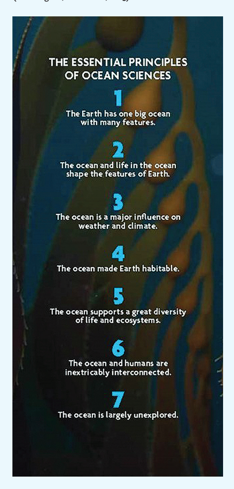
FIGURE 1. Principles of Ocean Literacy, from National Oceanic and Atmospheric Administration (NOAA), Ocean Literacy: The Essential Principles and Fundamental Concepts of Ocean Sciences for Learners of All Ages (Washington, DC: NOAA, 2013).

such as "ocean wilderness" or "ocean frontier," for example, carry weighty, and lasting, historical meanings and often act to countermand scientific understanding of the sea. The humanities can both identify such influences and also contribute to the creation of new narratives to support better understanding of the marine environment and our ever-changing relationship with it.