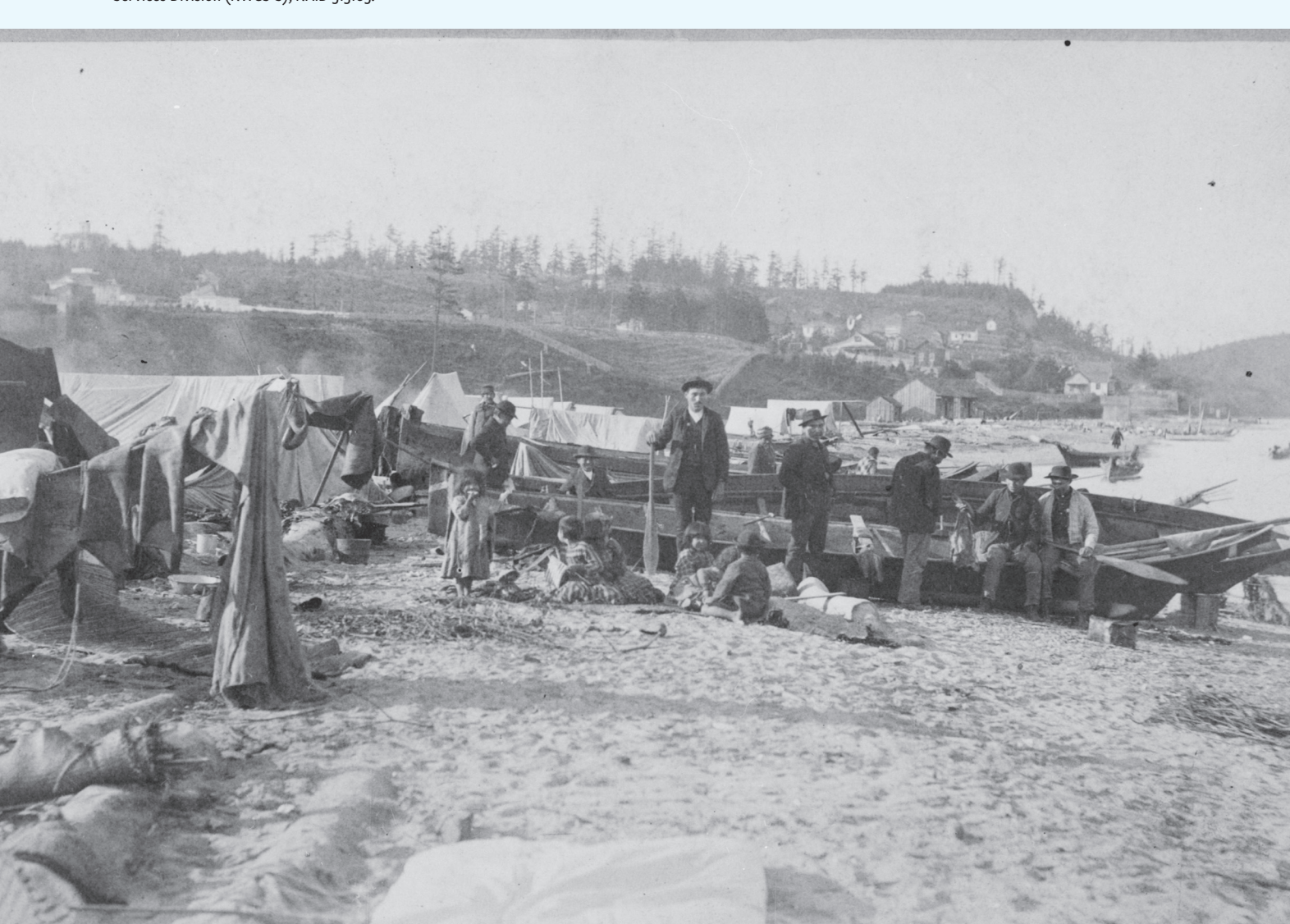
FIGURE 3. Makah tribal members preparing to put out into Puget Sound, ca. 1889. The original caption to the photo reads: "Makah tribe of Indians from Nee-oh Bay resting on the beach at Port Townsend while en route for the hop fields up Pudget-Sound, ca. 1890. The photograph was taken by J. M. McMurry of Port Townsend, Washington Territory." US Department of Commerce and Labor, Bureau of Fisheries photo. National Archives, Still Picture Records Section, Special Media Archives Services Division (NWCS-S), NAID 513105.

the ocean as a part of their territory (Figure 3), whereas ancient Greeks understood the forbidding "Ocean River" as outside the human realm completely.11 Until European explorers found sea routes between known and newly discovered lands in the 15th and 16th centuries, people around the globe knew their own coastal area, perhaps the sea it belonged to, or at most two linked ocean basins.<sup>12</sup> Indeed, even scientists have only recently viewed the ocean as a unified whole, as the title of the 2003 Pew Commission report, America's Living Oceans, suggests.<sup>13</sup> While scientists today insist on the importance of acknowledging one world ocean, this view contradicts historical reality for many, if not most, people around the world and through time. Politically expedient from an environmentalist perspective, the assertion of a singular ocean has enforced a presentist perspective, that is, a view of the past that is dominated by present-day