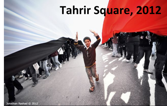
Tahrir Square, 2012

Increasing researcher and public awareness