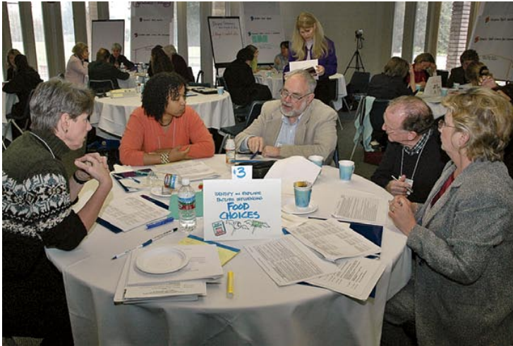
In January 2005, a broad range of stakeholders met in Davis to evaluate a new draft of the Nutrition Competencies document. A small group reviewed the third competency, on food choices.