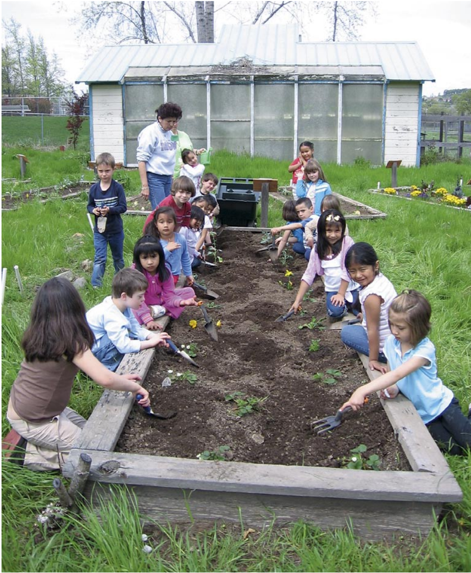
The Nutrition Competencies incorporate farm-to-fork nutrition-education strategies for all grade levels (K-12). At Rock Creek Elementary School in Auburn, kindergarten students tend their garden.

2003; Perez-Rodrigo and Aranceta 2001; Summerfield 1995; Sunseri et al. 1984). Lavin et al. (1992) stated that “schools are society’s vehicle for providing young people with the tools for successful adulthood.” Having the knowledge and ability to make healthful dietary and lifestyle decisions should be prominent in such a “toolbox.”