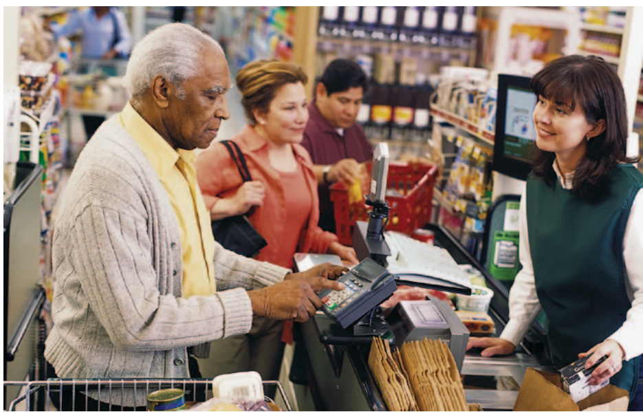
The relationship between certain nutrients and particular diseases is well established, such as iron and anemia, and calcium and osteoporosis; but the role of aging in how the body processes nutrients is not well understood.

having two sets of chromosomes) lose the ability to divide and, therefore, die. Senescence of the whole organism is characterized by a decline in the organism's ability to respond to stress, homeostatic imbalance and an increased risk of diseases associated with aging, leading ultimately to death. Genetics may affect the natural rate of aging within species as seen in mice, which are elderly at about age 3, and some reptiles and fish, which age at a much slower rate. Life-span variation within species may be related to inherited differences in the organism's ability to slow the aging process, such as the efficiency of DNA repair, levels of antioxidant enzymes and rates of free-radical production, called the Gompertz-Makeham law of mortality (Gompertz 1860).