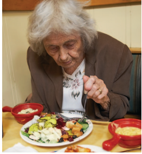
Dietary intake changes with age, perhaps due in part to physiological changes in the digestive system that make older people feel full faster.

control over visceral activities, water balance, temperature and sleep) may also result in reduced food intake. In older men, declines in the hormone testosterone and increases in the hormone leptin, which regulates hunger and energy expenditure, may also explain some of the decline in energy and food intake. Studies at UC Davis with senescent (aging) Fischer rats have documented shorter feeding times and smaller intakes, which may be suggestive of earlier satiation (Blanton et al. 1998).