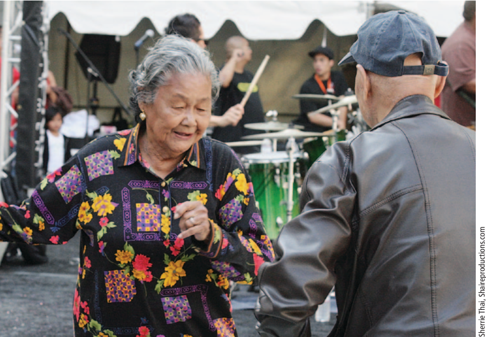
A public health approach to aging would promote the conditions under which people can be healthy, with emphasis on increasing wellness rather than preventing disease.

The number of older Americans is projected to double by 2030, and one in