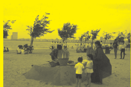
Chowpatty Beach, Bombay