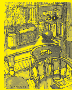
A Private Place