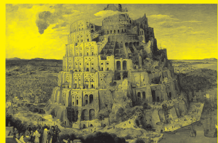
Tower of Babel