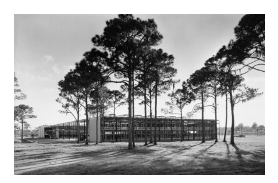
Image 8: Riverview High School.

Perhaps most notable among Riverview's many innovative features were Rudolph's unique structural responses to the Florida climate. To control for sunlight, but to still allow for air circulation, Rudolph designed a non-electric, energy efficient system that featured series of sunscreens--or suspended horizontal panels made from precast concrete--which alternated in their top-and-bottom placement. These panels covered the school's upstairs and downstairs hallways, which Rudolph located outdoors. (Rudolph's innovative idea for announcing a structure's pedestrian flow outside instead of inside a building's primary shell would be reprised in Richard Rogers and Renzo Piano's revolutionaryinside-out building design for the Pompidou Center in Paris 30 years later.)