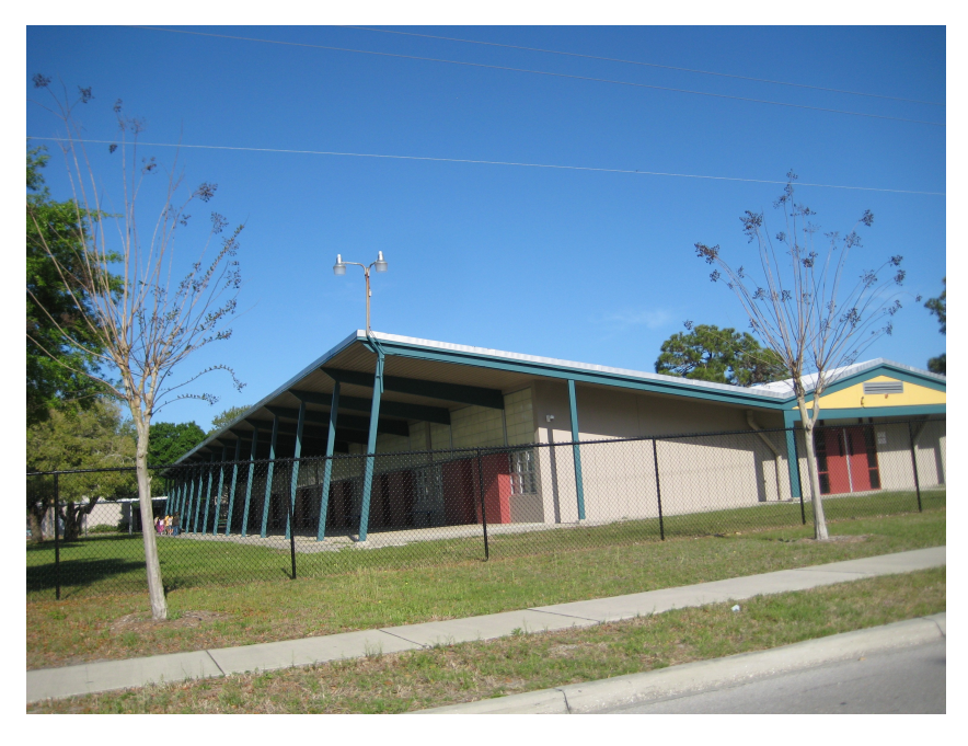
Image 6: Alta Vista Elementary School Addition, main façade, looking north, April 2010.

wind damage. "We had to make many of these changes to meet updated building codes," Dr. Barbara Shirley, Alta Vista's knowledgeable current principal ruefully explained to me one Monday morning before school. But perhaps the most striking