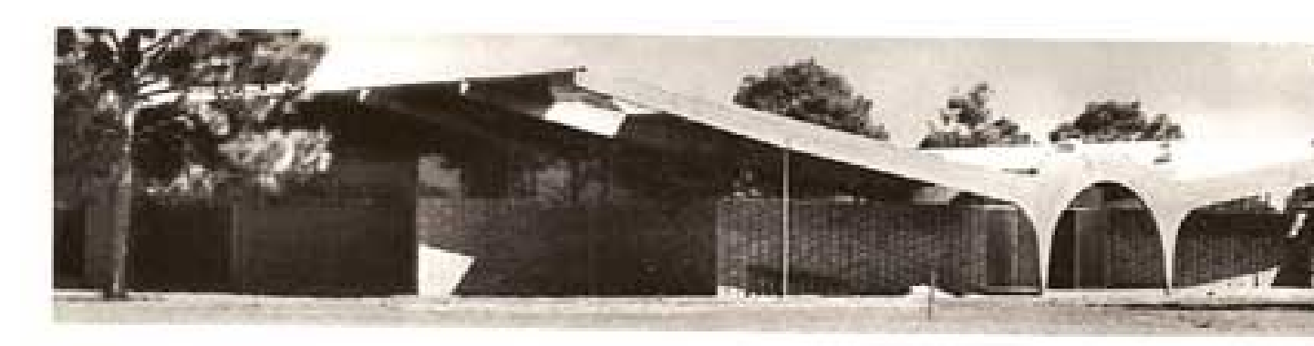
Image 2: Alta Vista Elementary School Addition, main façade, looking north.

The addition to the Alta Vista Elementary School was the second school built in the Sarasota County School Building program. Designed by Victor Lundy, the 12 room addition opened in 1957 and was a dramatic departure from the original box-like elementary school that itself was constructed only four years earlier to provide for a growing population on Sarasota's East side. Lundy's design was visually defined by its soaring, upswept, double-wing roof with 18 foot overhangs that ran the entire length of the building. Constructed from native yellow pine and fir and integrating laminated technologies, the beamed roofline conveys the impression of flight, as if the entire building were soaring above air, a feature that gave the addition its popular name, "The Butterfly Wing." In his notes, Lundy remarked how he consciously designed the addition "for the effect it would have on the kids. [The building] has a feeling of optimism; it shoots upward and outward."