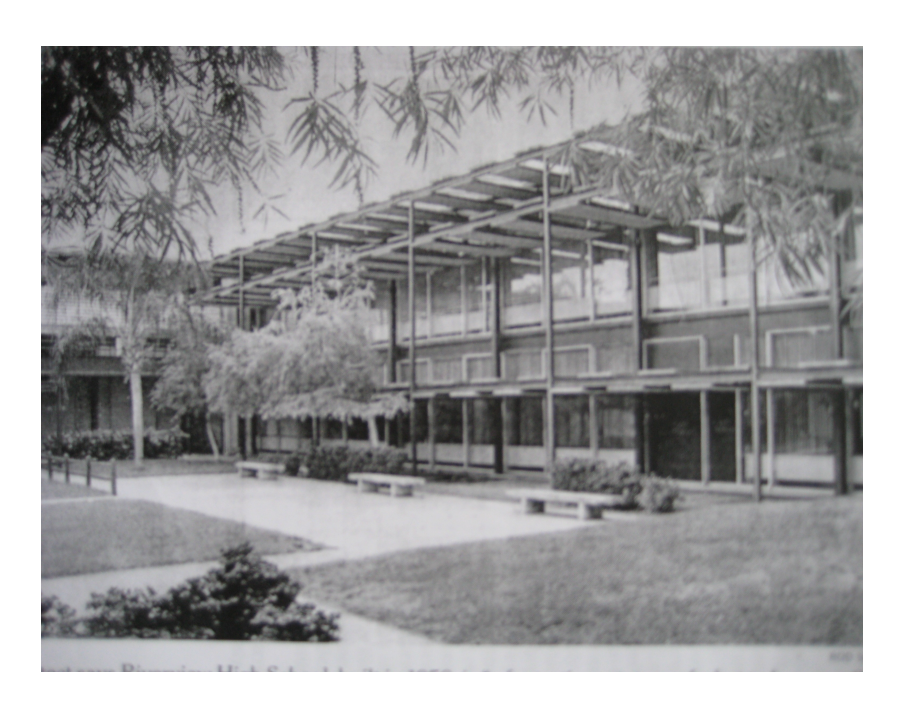
Image 9: Riverview High School, courtyard view.