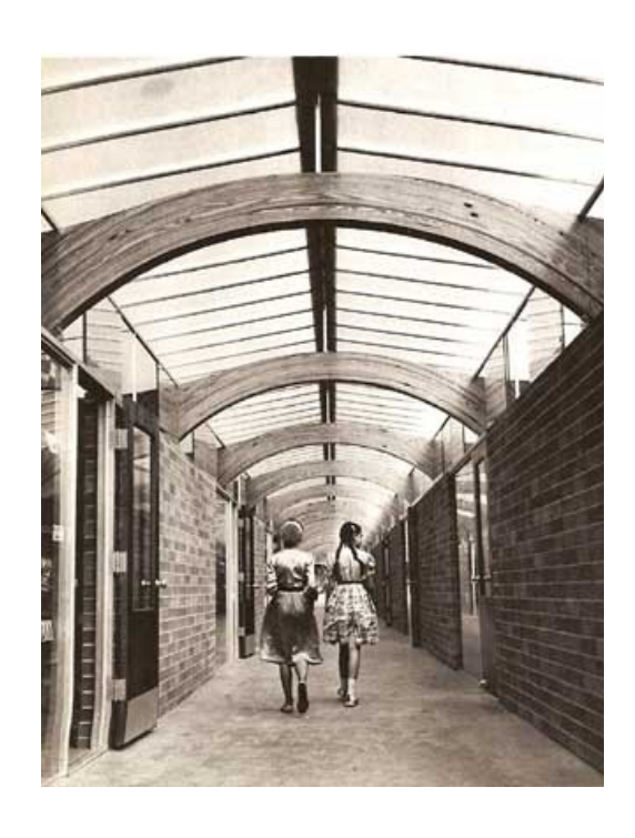
Image 4: Alta Vista Elementary School Addition. Inner Atrium and Corridor.

Classrooms in the Lundy addition opened along a long central atrium surmounted by a full-length glass skylight that further amplified the sensation of openness and light. To dissolve the long-standing architectural isolations of classroom and school space from the outside world, each classroom had floor-to-ceiling glass windows and sliding glass doors that promoted extended possibilities for teaching and learning. The classrooms themselves were separated by flexible partitions (rather than fixed walls) that could be opened or closed for diversified student groupings and large/small team-teaching opportunities. Lundy's imaginative attention to even the most taken-for-granted detail is also revealed in his interpretation of the addition's brick walls at the east and west ends of the building. The rhythmic, alternately-cast brick surfaces with their rows of chevron motifs further emphasize the wing-like architecture of the building itself and simultaneously suggest the endless folding and unfolding processes inherent in the activity of learning and the educational experience.