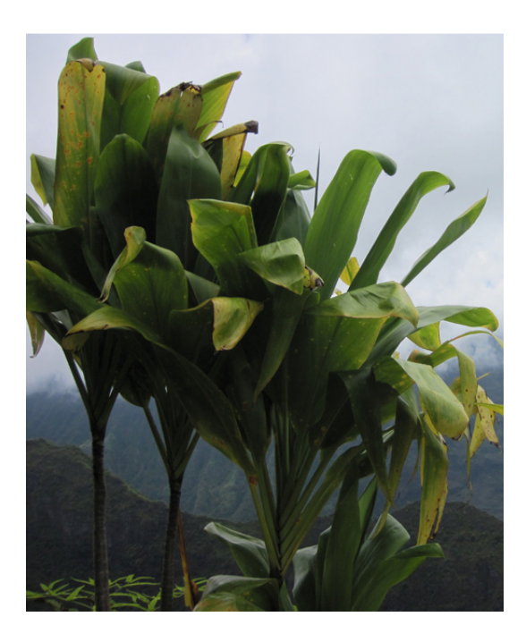
FIG. 1. Cordyline fruticosa, ti.

Studies of introduced taxa brought by the voyaging Polynesians could be a source of evidence to understanding the culture and colonization of islands. Though the origin of C. fruticosa is not known, it may have