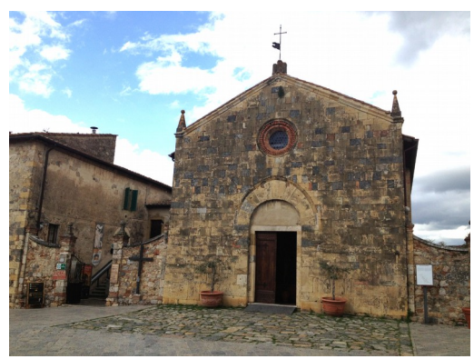
Figure 2. Photo that inspired the poem "Montereggio Evening."