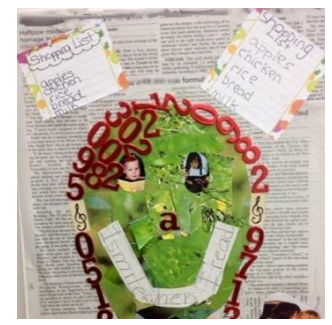
Figure 3. Literacy Self-Portrait created by Bethany, an inservice teacher.

Going beyond the written literacy autobiography, the multimodal art project, or abstract literacy self-portrait, created an opportunity for teachers to expand definitions and concepts of literacy by using a variety of materials to represent their literacy experiences. In university courses and CCWP invitational institutes, each teacher was given a blank piece of oak tag or a large sturdy sheet of paper. Piled on a desk were myriad materials, such as fabric, magazines, cards, buttons, feathers, pipe cleaners, ink stamps, newspapers, stickers, gift wrap, and tin foil. Also on the desk were a profusion of glue, tapes, and scissors, as well as a basket of crayons, colored markers, and pencils. Teachers were invited to use these and any other materials as meaning-making objects to represent their literacy identity and experiences, and each material used was expected to serve a specific representational purpose. Although the portraits generally started out as two-dimensional projects, some developed into three-dimensional projects, while others took on a more abstract look. Interestingly, most teachers chose to include words as part of their self-portrait, or visual text (see figures 3 and 4).