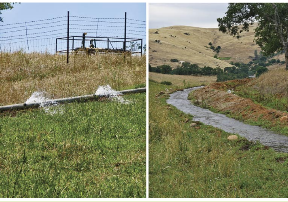
The 12-acre pasture was irrigated at different rates, above and center , in order to measure the amount of fecal bacteria flushed from the field. Grazing was also limited prior to irrigation for varying numbers of days. Right , a ditch delivers irrigation water to the pasture.