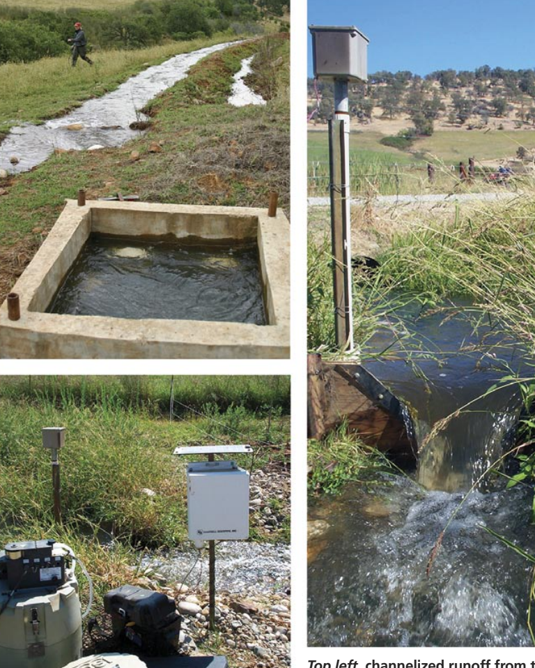
Top left , channelized runoff from the pasture was collected in a small basin. Above , V-weirs were fitted with, left , autosamplers to monitor E. coli concentrations.

Although the primary regulatory concern with E. coli centers on concentration, it is also important to consider the reduction in E. coli load (the total number of E. coli entering and exiting the wetland) per irrigation event. We calculated the percentage of total number (cfu) of E. coli retained within the wetland during each event from the difference between inflow and outflow load, and found that percent reduction ranged from 33% to 91%, with an average of 73% (table 1). These results are comparable to previous findings that relatively narrow (1 to 2 yards wide) vegetative buffer strips can reduce E. coli and C. parvum in runoff by as much as 90% to 99% on California's annual grasslands under rainfall-runoff conditions (Atwill et al. 2002, 2006; Tate et al. 2004, 2006). Reductions of 80% to 99% have been seen for E. coli and fecal coliforms with the use of constructed surfaceflow wetlands to treat municipal and