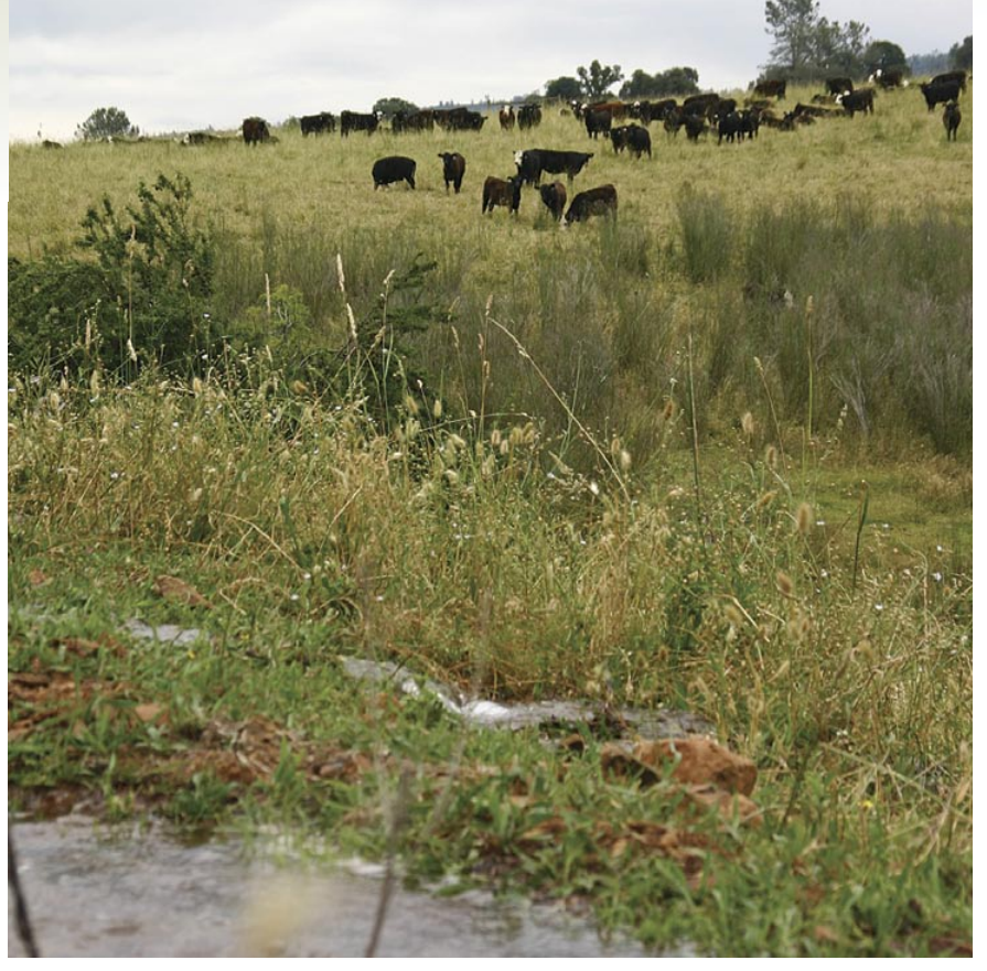
A study at the UC Sierra Foothill Research and Extension Center examined the ability of small wetlands to filter E. coli in runoff from irrigated, grazed pastures. Such disease-causing pathogens pollute waterways across California.

Pathogens that can cause illness in humans include protozoa such as Cryptosporidium parvum and Giardia duodenalis , as well as bacteria such as Salmonella and Escherichia coli O157:H7, a virulent strain of the commonly found coliform. The sources of these pathogens are diverse; they are shed in the feces of wildlife, humans, livestock and pets found across most watersheds. Pathogen contamination can come from point sources such as discharge from munici-