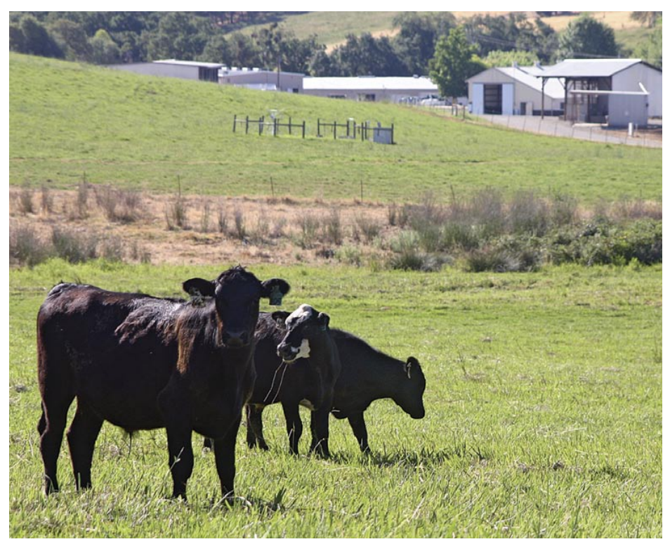
Wetlands can reduce E. coli runoff from irrigated pastures, but their use should be integrated with management strategies such as timing grazing prior to irrigation and minimizing the volume of irrigation tailwater.

livestock wastewater (Gerba et al. 1999; Hill 2003; Quinonez-Diaz et al. 2001).