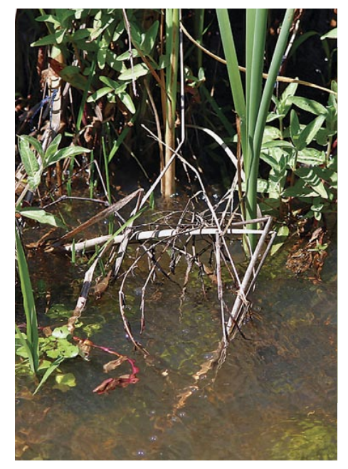
Runoff below the wetland had significantly lower E. coli concentrations; nonetheless, 95% of the samples collected still did not meet federal standards for E. coli .

pass through a wetland, can be a major factor influencing the efficiency of the wetland to retain pollutants (Blahnik and Day 2000). Longer residence times, often associated with lower runoff rates, generally result in greater retention of pollutants (Knight et al. 2000). Determining the hydraulic residence time for a study wetland allows extrapolation of the results to other wetland systems.