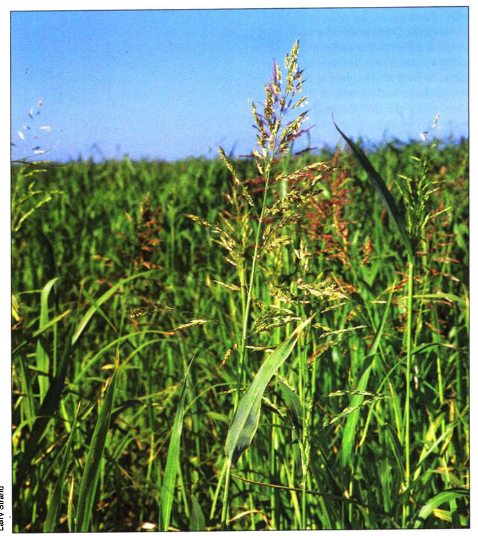
Sudangrass-hay acreage quadrupled from 42,000 acres to nearly 172,000 between 1988 and 1997. However, little is known about its water use.

As competition for water resources among the municipal, industrial and agricultural sectors of California intensifies, estimations of water value are needed to fairly allocate the limited water supplies available in a region. That is, from a water investment perspective, what is the expected return and variability (the risk) of each unit of water invested in crop production within the region? The production of forage hay (alfalfa and sudangrass)