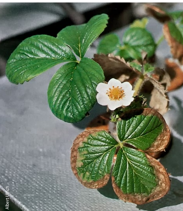
Toxic levels of salt cause strawberry leaf margins to turn brown and dry.

In 2000, soil EC (EC e ) and Na concentrations generally increased with increasing depth at all the sites (table 3). The values at sites 2, 3, 4 and 6 were roughly equivalent to those at the control site; at sites 1, 5, 7 and 8, values were much greater. Approximately a decade later, EC e and Na concentrations had increased slightly in the 1 to 12 inches subprofile at the control site and sites 2, 3 and 4, while decreasing at site 6. Changes in the whole profile averages (the sum of the amounts at the three subprofiles) of EC e and Na were mixed at the control site (i.e., there was a slight increase in EC e and a decrease in Na) and site 4 (i.e., an increase in Na and a slight decrease in EC e ); at sites 2 and 6, EC e and Na decreased; and at site 5, they increased slightly. At sites 3 and 7,