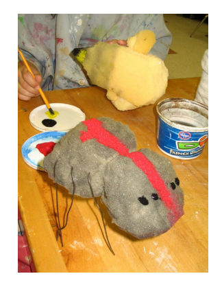
Figure 6. Female students attended to the female heroine and her kindness to the baby Ohm. This sculpture made of foam parts resembles the baby Ohm.

Discussing the powers of super bugs in the animé motivation through guided questioning empowered students to reflect on a humanistic animé message about futuristic environment concerns including caring for all living beings (Anderson & Milbrandt, 2005). The students were able to transfer some helpful knowledge about bugs: they cultivate soil, manage population, and kill disease. Costantino (2007) found that middle school students respond effectively to images that move them. In our study, most students remembered the salvation of the baby Ohm and interpreted Princess Nausicaa as caring, kind, and friendly to bugs. Observed students thus showed some empathetic understanding and constructed a few ecological connections between their inner and outer worlds.