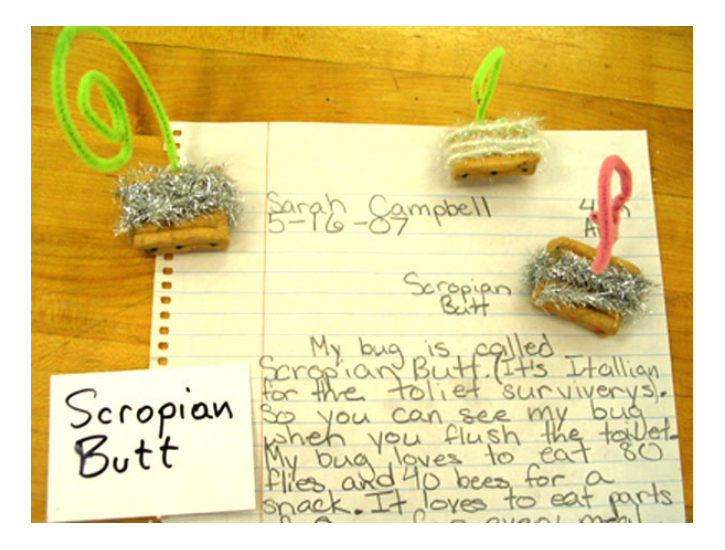
Figure 4. Another female student explained, "Scropian Butt. It's Itallian for the Toliet surviverys [sic]. It loves to eat 80 flies and 40 bees for a snack."

Most students combined two to three sculptural parts as in this example (Figure 5). "Turgion Fly is made out of [eight] spider's eyes and legs, scorpion's body [pincer & stinger], and a butterfly [feathers]," interpreted one female. Only four students succeeded in identifying these parts, such as "wormlike body and butterfly wings." Students might have been preoccupied with finishing their artwork more than in writing their reflections.