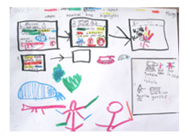
Figure 2. An unusual visual interpretation was one male student's {WHY DENOTES singular possessive?] color-coded action sequence: red for weapons and warriors, green for Nausicaa, and blue for the Ohm bugs.