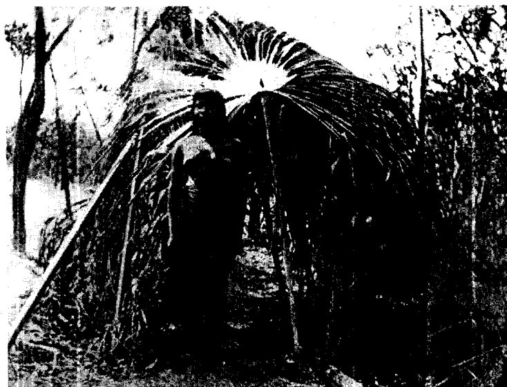
FIG. 3. Temporary round hut of the Ramko'kamekra.

Although the terms for husband's brother and for brother's wife (m. sp.) are not recorded, the vocabulary for affinities is evidently ample. The discrimination between wife and wife's sister is consistent with the absence of the sororate.