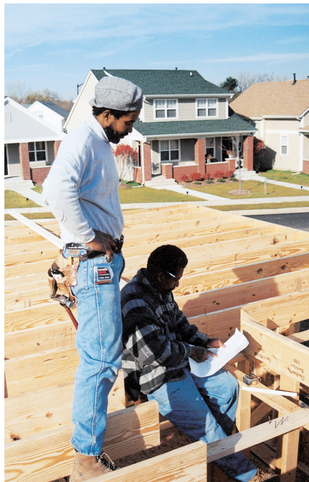
Armonics, an Indianapolis-based architecture firm, has used computer tracking to diversify the number of builders involved in a HOPE VI project, providing more opportunities for small firms and local workers, and allowing for more fine-grained design variation among homes.

While analysis of regional vernacular building materials