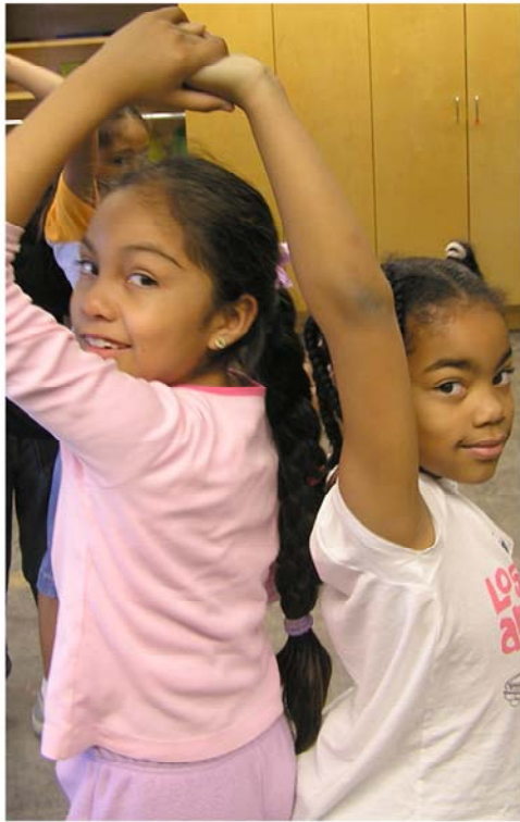
15: Freese students dancing "Verbs."

visiting artist, there's not really any kind of problem. Everybody wants to be involved and participate. Usually, behavior issues don't arise. Kids don't act up because they want to be there. It's not, 'This is too hard for me so, instead, I'll act out.' It's enjoyable and fun. So, I think that kind of reels them back into school for awhile."