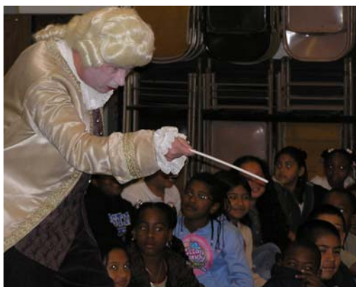
5: Mainly Mozart Assembly at Freese Elementary.

This situation is especially problematic for children who speak a language other than English at home. When young English learners first enter a traditional U.S. public school, they attempt to use their home language to communicate with teachers and peers (Saville-Troike 1987; Tabors 1997). Gradually, the children realize they are not being understood. At this point, a shift occurs. The child begins to actively attend to the new language (Ervin-Tripp 1974; Hakuta 1987, Itoh and Hatch 1978; Tabors 1997). At this stage, the child will attempt to communicate nonverbally, using gestures and facial expressions. A third stage occurs when the child masters the rhythm and the intonation of English, as well as some key phrases (Tabors 1997). In the fourth stage, the child learns vocabulary and moves into productive language use; children express themselves by using their own words (Tabors 1997). At this stage, the child demonstrates a general understanding of the rules of English and applies them more accurately.