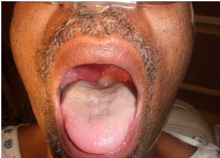
Figure 1. Oropharynx of patient showing hydropic uvula deviated leftward by right peritonsillar abscess.

without incident, and the patient was admitted to the intensive care unit to monitor his respiratory status. The patient was continued on clindamycin and steroids in the hospital. Symptoms completely resolved on day three and he was discharged.