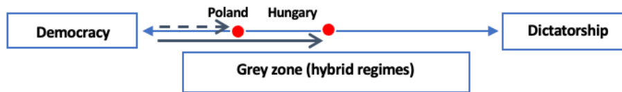
Figure 1. Kaczyński’s Poland and Orbán’s Hungary on the democracy–dictatorship axis. The Polish trajectory is a dashed line, the Hungarian a continuous line.

This presentation implies that Poland and Hungary are walking the same path—as if the same process is taking place in both countries, and the de-democratizing difference between them is only quantitative. But going from a single-level to a dual-level approach, and considering the presence or lack of patronal transformation, it can be seen that democratic backsliding in the two regimes indeed follows qualitatively different trajectories (figure 2).