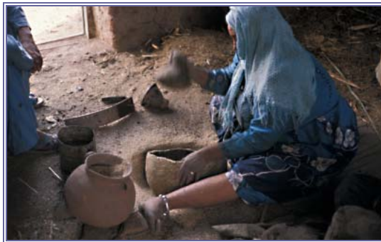
Figure 5. Making a water storage vessel ( qird ) using a paddle and anvil and a hollow for shaping. Deir Mawas, Middle Egypt.

the vessel) is incorporated. Non-radial methods treat the vessel as though it were a piece of sculpture and essentially model it without reference to a particular vertical axis. In the free-radial method the pot might be constructed by coiling or rotating intermittently as the clay is drawn up to form the walls. Centered-radial techniques involve a rotating support with a fixed central axis—the potter’s wheel. The rotation of this device at speed allows the use of centrifugal force to help in the drawing up and shaping of the vessel.