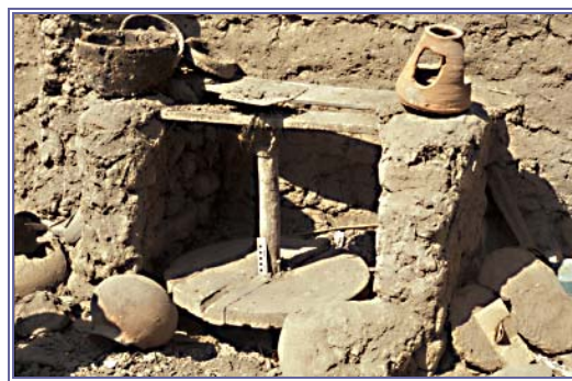
Figure 6. A typical kick-wheel. Deir Mawas, Middle Egypt.

Arnold and Bourriau (1993: 17) differentiate between types of wheel and whether they are rotated by hand or “kicked” by movement of the foot (fig. 6). All wheels, however, are capable of producing pottery using centrifugal force, as has been demonstrated in experiments by Powell (1995) (fig. 7). The first known wheels appear in the Old Kingdom (Dynasty 5 or 6), with the kick-wheel perhaps appearing in the Late Period.