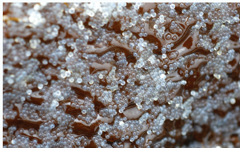
▼ K'aaw herring roe PARKS CANADA

The herring also spawn in Gaw (Masset Inlet). There are stories of our people felling young hemlock trees in the rivers, and the herring would spawn on the