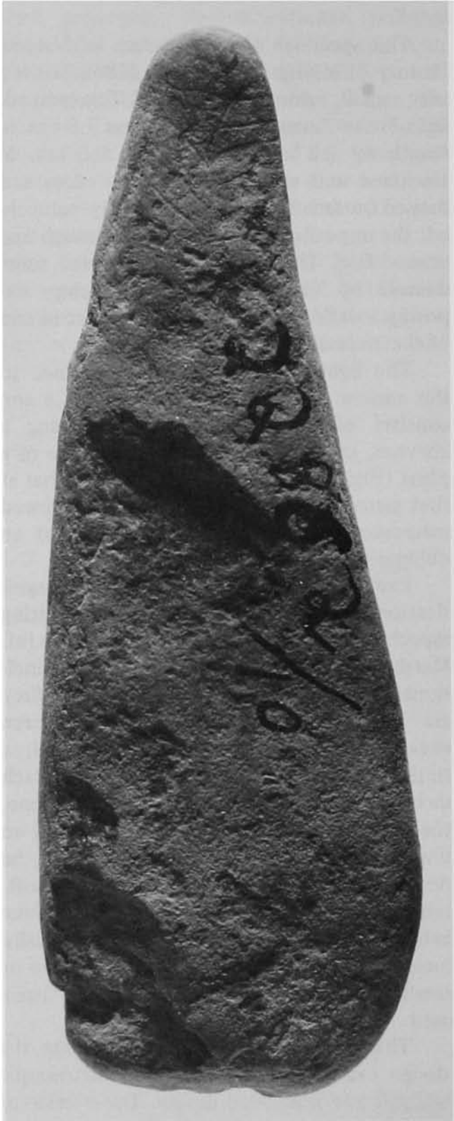
Fig. 1. Photograph of incised stone from Level III of Danger Cave (7.8x2.8 cm.).