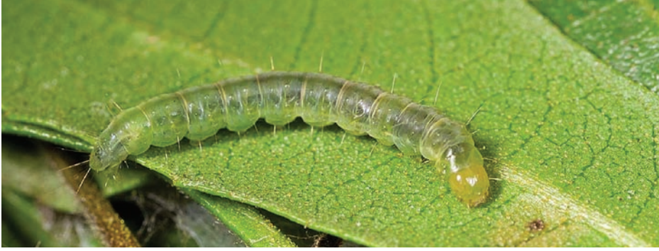
The leafroller's mature larva feeds on hundreds of different plants and agricultural crops.