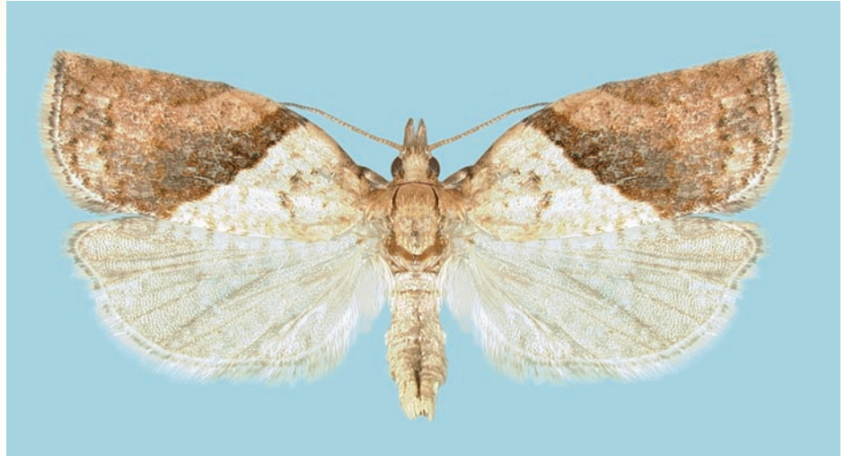
The light brown apple moth, a tortricid leafroller, is extremely variable and difficult to identify visually. The insect's reproductive organs must be examined in order to obtain a positive identification.

Although light brown apple moth has been confirmed in 14 counties, only por-