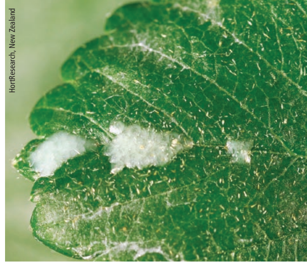
Eggs of the light brown apple moth are typically deposited on the upper surface of host leaves in masses of 20 to 50.

year in the Central Valley and Southern California. The lower and upper developmental thresholds for light brown apple moth are 45°F and 88°F, respectively (Danthanarayana 1975). Completion of the entire life cycle requires 620 degree-days above 45°F. In Australia, New Zealand and the British Isles, generations overlap. Light brown apple moth does not have a winter resting stage (diapause). Cold winter temperatures