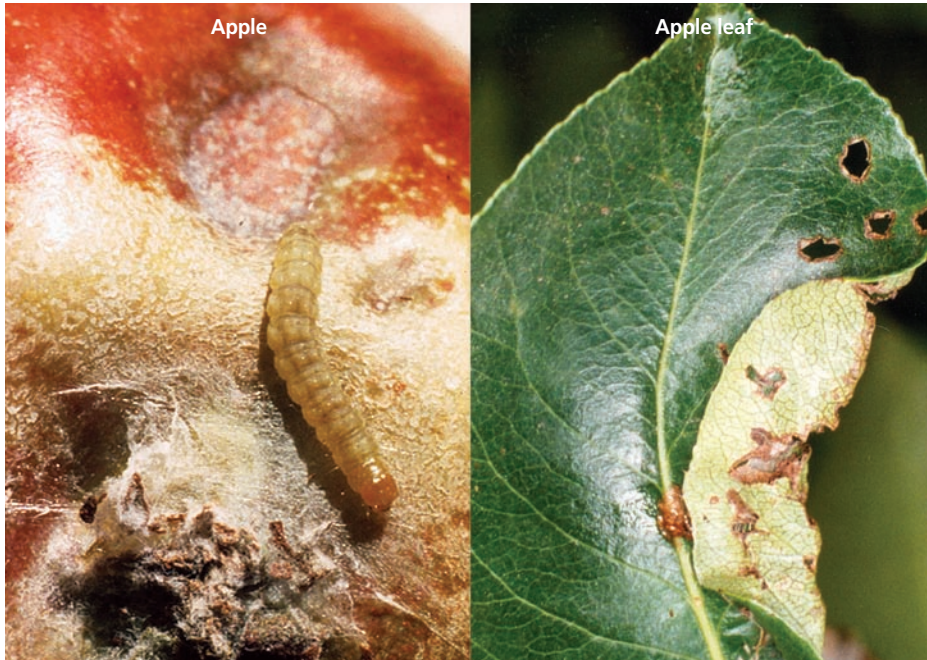
Originally from southern Australia, the light brown apple moth can feed on and damage a broad range of crops such as, above, apple. If the pest becomes established in California the most important impact to growers will likely be trade restrictions on crop exports.

webbed together, a leaf webbed to a fruit, or in the center of a fruit cluster. The larvae feed within these shelters, and they may feed on fruit when it touches a leaf. Larvae on fruit are most likely to be found near the calyx, the residual basal flower parts. When disturbed they wiggle violently, suspend themselves from a silken thread and drop to the ground, where they feed on groundcover hosts. Larval development can take from 3 to 8 weeks, depending on temperature. Pupation is completed inside the silken feeding shelter. The pupal stage lasts 1 to 3 weeks.