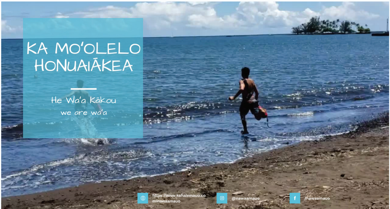
▲ Screenshot from Ka Mo'olelo Honuiaiākea short film. Links depicted are in the text, below. HŌKŪ PĪHANA

oceans and strengthen the mo'okūauhau o Nā Wa'a Mauō.