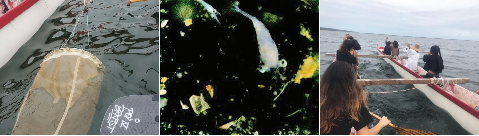
▲ (left-right) Students completed their plankton pulls; microscope image of zooplankton collected; paddling technique training HÖKŪ PIHANA

► Community interview with Lauren Kapono conducted by our Nā Wa'a students at Waiuli in Keaukaha, Hawai'i. HÖKŪ PIHANA