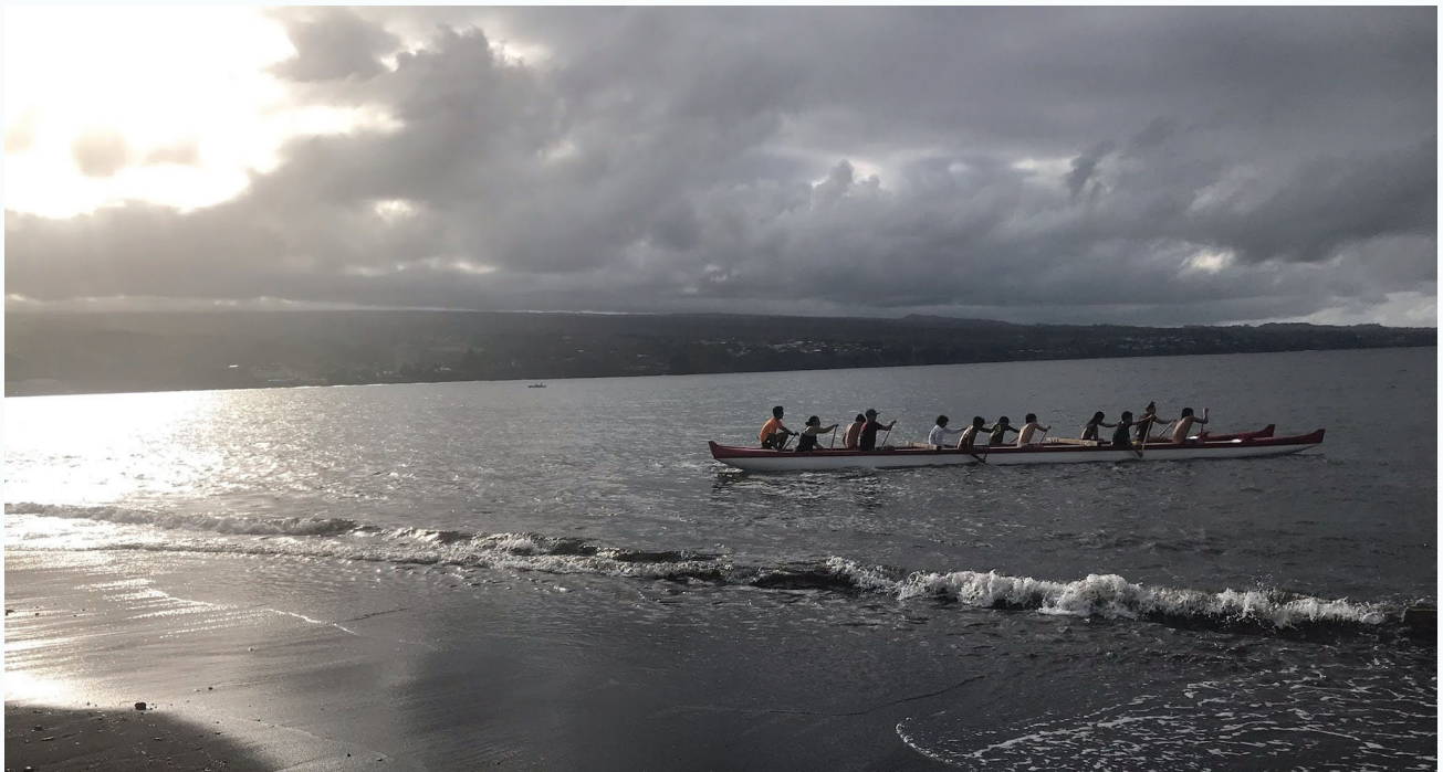
▲ Nā Wa'a Mauō students open each practice by strengthening their paddling timing and technique skills.

our communities and planet. For us to support justice and equality for people, we must ground ourselves in our Indigenous identity as Native peoples, share our practices with our families and communities, and work together to sustain 'āina mauō. Through these pathways, Nā Wa'a Mauō and the Honuiaiākea Voyaging Program will evoke justice and equality for our indigenous practices, people, and places.