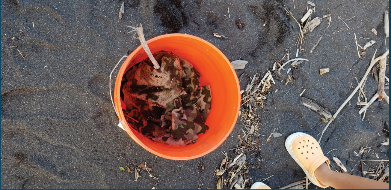
▲ Students collecting rubbish during our beach clean-up.

Mālama ‘āina , our kilo and time spent with place, evokes our desire to care for and give back to the place that has given to us. Tending to our oceans and ‘āina contributes to the health and wellness of ourselves and the environment. This reciprocal action strengthens the relationship between kānaka and ‘āina and awakens the desire to steward that space.