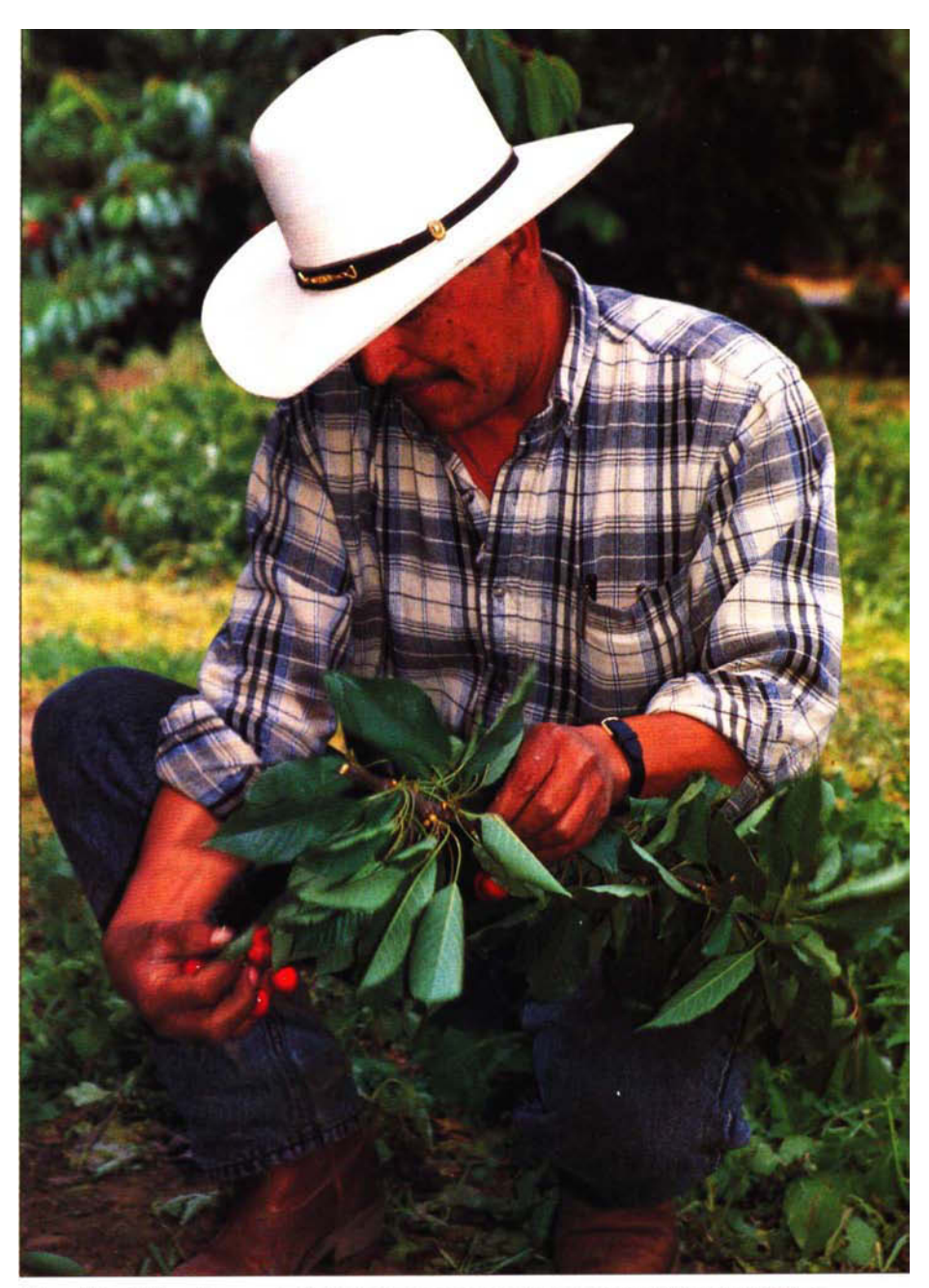
When identifying the most challenging and rewarding aspects of their positions, farm supervisors overwhelmingly selected their relations with people.

Those in upper management were six times more likely to fire an employee (85%) than first-line supervisors (14%). Respondents recalled having fired the last person as long as 44 years ago and as recently as 2 weeks ago, with an average of a little over 10 years since the last termination. Considering that the average time working as a supervisor was 14 years, it is clear that farm employees are not often terminated. In several instances the distinction between the employees being fired or quitting was blurred, as was the distinction between being fired or simply not rehired the next season. With the exception of two instances,