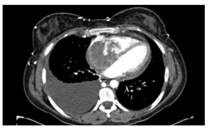
Figure 2. Axial computed tomography angiogram of the chest showing intracardiac contrast-filling defect with an associated right-sided pleural effusion.