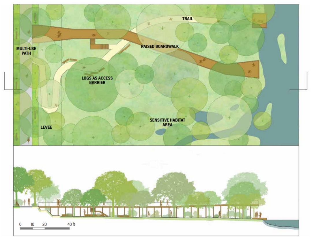
Figure 4: A typical site design of urban waterfronts, showing multi-use trails at habitat edges to preserve sensitive habitat zones with limited human trail access. Drawing Credit: Vanessa Lee (SFEI).