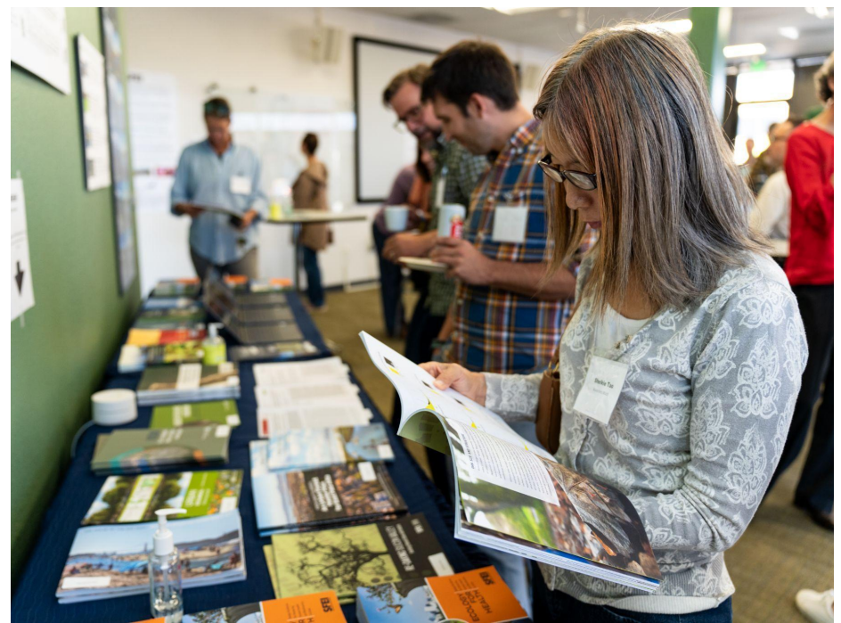
Figure 7: Salon attendees reading other SFEI publications related to urban ecological and resilience planning and design.

Salon attendees identified two primary ways in which they intend to use the design guide. First, they plan to incorporate the planning and design strategies into their ongoing and future urban greening projects. This includes addressing design trade-offs between health and biodiversity support, as well as exploring the human health benefits associated with open space and green infrastructure design. Second, they aim to reference the human health and biodiversity benefits identified in the guide when communicating the benefits of urban greening efforts, particularly tree planting and open space design, to their stakeholders and/or clients.