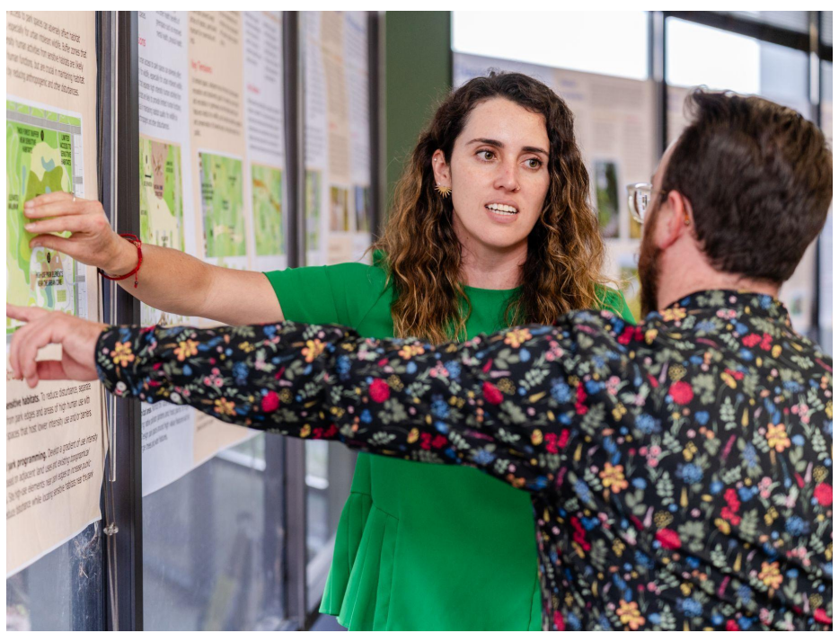
Figure 5: Salon attendees discussing the regional and city parks strategies presented by the Ecology for Health guide.