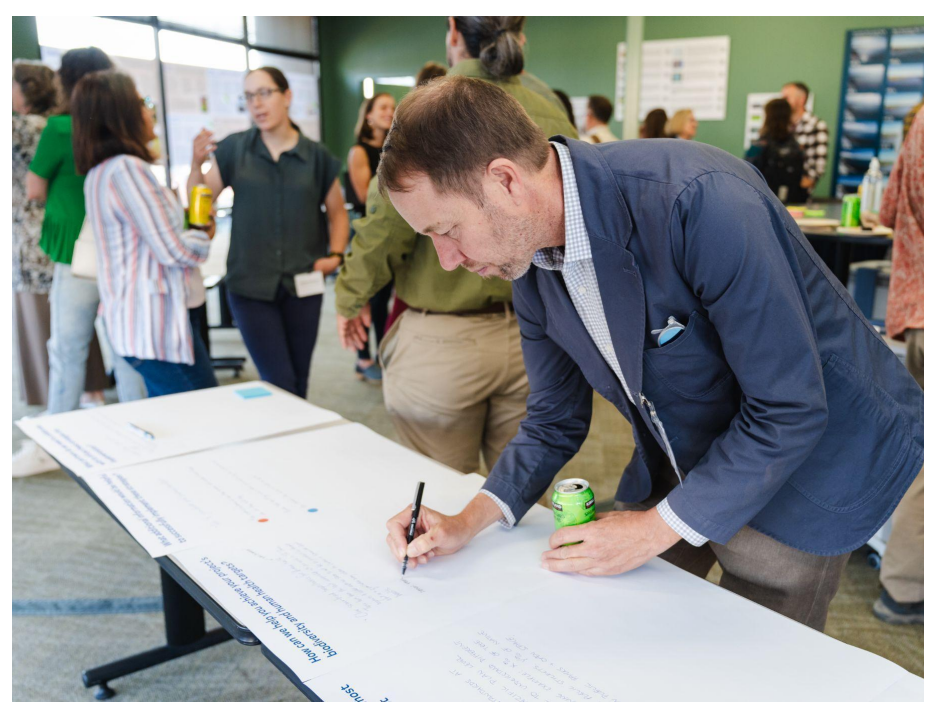
Figure 6: A salon attendee providing thoughts on a feedback board related to how the Ecology for Health team can help support projects in achieving biodiversity and human health goals.