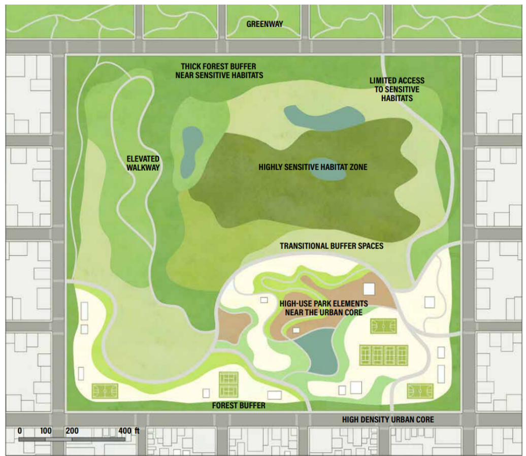
Figure 2: An example of regional and city parks that demonstrate a gradient of use intensity in park areas based on adjacent access, land uses, and existing landscape features. Drawing Credit: Vanessa Lee (SFEI).

patches, as opposed to small, dispersed patches, limit access to those who can afford to live near them and may be more likely to contribute to green gentrification.<sup>3</sup> When resources are limited, planning for greenspaces to be distributed throughout the city can create habitat stepping stones for wildlife and provide recreation access to more residents.