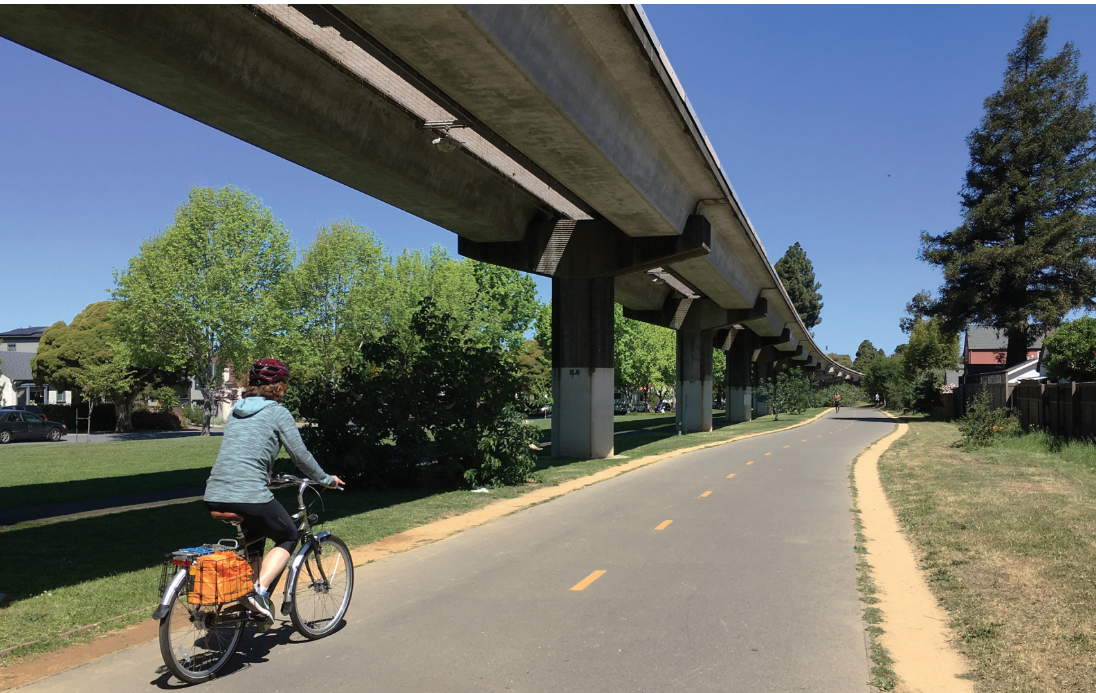
▼ Bicyclist riding up the Ohlone Greenway, by the Bay Area Rapid Transit (BART) tracks, Albany and Berkeley, California, USA.