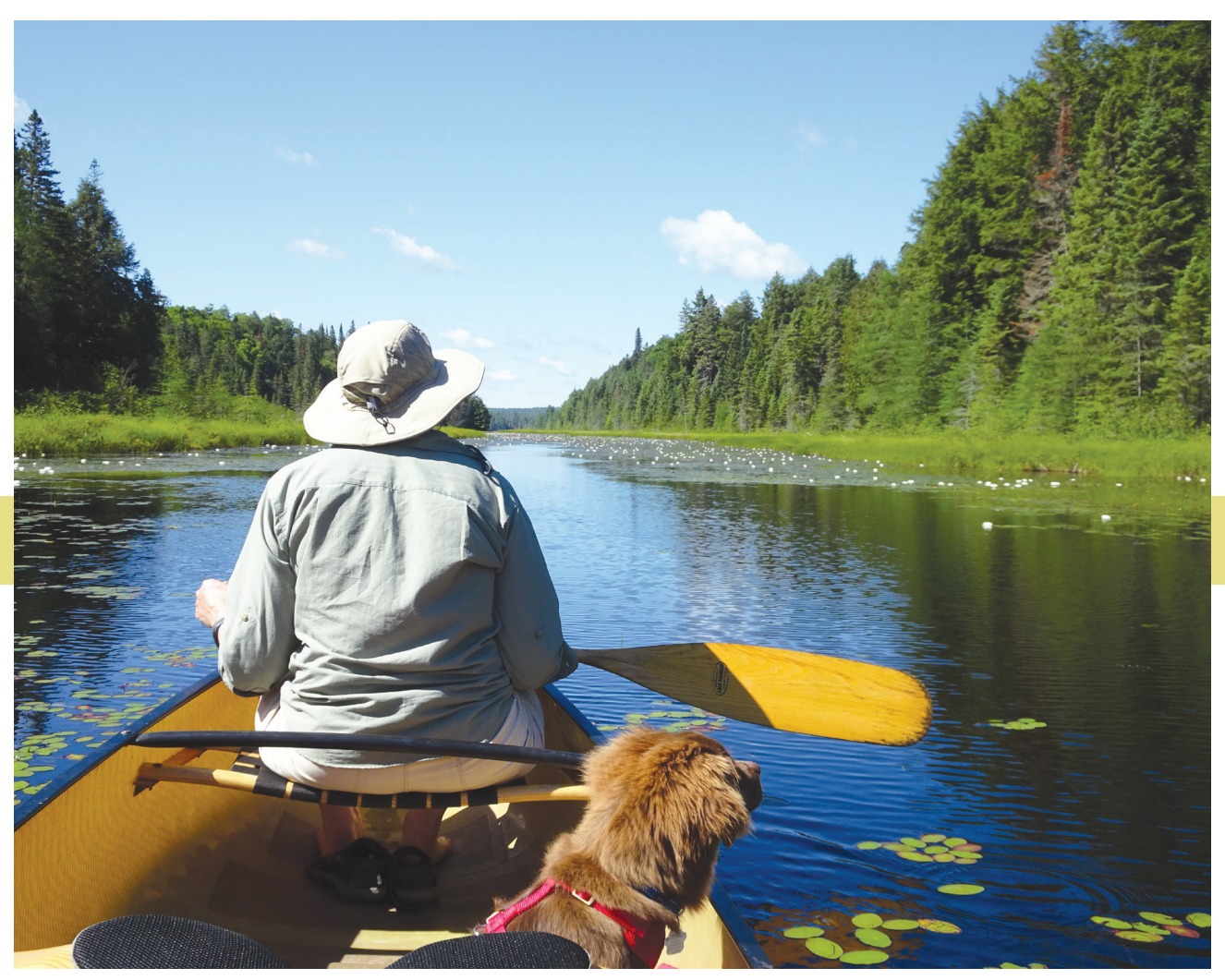
An increase in protected and conserved will bring a wide range of additional benefits, including recreation and the health benefits of being in nature. Algonquin Provincial Park, Canada STEPHEN WOODLEY

need conserved ecological corridors (Hilty et al. 2019). Ultimately, ecological networks of protected and conserved areas and ecological corridors offer an ecological design solution to best manage climate change and habitat fragmentation.