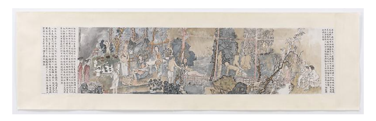
Figure 4. Yun-Fei Ji, The Garden Party, 2009. Watercolor and ink on Xuan paper mounted on silk, 19^7/8 " x 69\frac{1}{2} ". Copyright Yun-Fei Ji. Courtesy of the James Cohan Gallery, New York.

of the dead and the grotesques that previously inhabited his landscapes. As examples, the figures in The Three Gorges Dam Migration , Blind Stream (2008), The Wait (2009), and The Guest People (2009) depicting displaced persons, and The Garden Party that images the depraved behavior of the powerful, are drawn in a fluid realist style forgoing the Bosch-like nightmare content of the earlier scrolls (see Figure 4). Turpitude gives way to lethargy expressed in the bodies of the dislocated as well as the self-indulgent. All these paintings are more colorful than past work, and the calligraphic strokes that form the landscape are even more multifarious than in the past paintings. Most of the scrolls have columns of Chinese writing on the sides, a motif that binds them even more closely to the classical tradition.