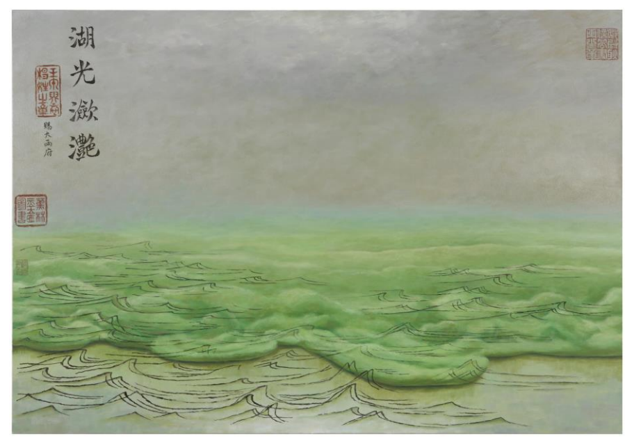
Figure 12. Zhang Hongtu, Re-make of Ma Yuan's Water Album L (780 Years Later), 2008. Oil on canvas, 50" x 72".