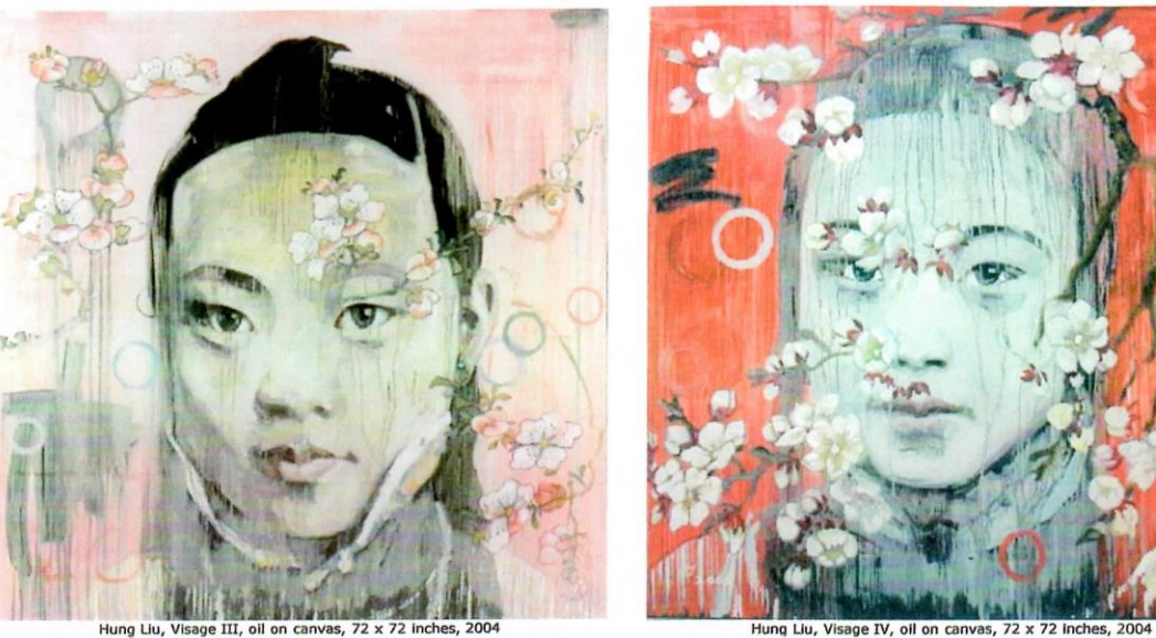
Figure 6. Hung Liu, Visage I, II, III, IV, 2004. Oil on canvas; I and II, 51%" x 48"; III and IV, 72" x 72".

In contrast, in the 2008 exhibition Half Life of a Dream at SFMOMA, Liu exhibited a large oil triptych We Have Been Naught, We Shall Be All (2007), based on scenes from an actual event in the Second Sino-Japanese War of the 1930s and 1940s. Her source, Ling Zifeng's 1949 propaganda film, Daughters of China, chronicles a group of women soldiers carrying the body of a dead comrade into the river—having chosen death by drowning rather than be taken prisoners by the Japanese. This monumental work glorifying women's roles in fighting the Japanese is an interesting return to the use of socialist realism—animated by vibrant brushwork—to depict an event in