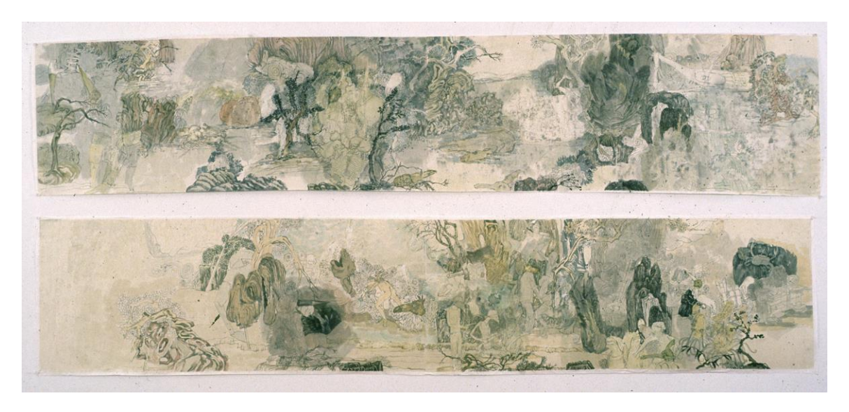
Figure 2. Yun-Fei Ji, The Garden of Double Happiness, 2001. Ink and mineral pigment on mulberry paper, 40" x 108". Collection of Ninah and Michael Lynne. Copyright Yun-Fei Ji.

vehicles abandoned in the landscape; other mutant vehicles and science-fiction machine parts that had no discernible purpose; circa-1950s gas pumps; ominous helicopters whirring through the air at an angle; tilted basketball hoops; bereft cartoon figures; and scattered bones; to mention just a few examples." Other examples occur in one of the most complex and brilliant of the group of scroll paintings, The Garden of Double Happiness (2001), in name and content an homage to Hieronymus Bosch with no stretch of the imagination (see Figure 2). Sexual perversions with or by half-human, half-animal creatures and concocted grotesques are embedded everywhere in the landscape. The horizontal scroll is washed in pale browns, tans, blues, greens, and pinks, both a reference to traditional painting and a way of emphasizing the fading landscape, while a marvelous array of pen and brush patterns evokes nature's beauty. While bringing to mind a distant history, things like the overturned jeeps and the pathetic figures wearing dunce caps are part of what returns us to the recent past. The intelligentsia was made to don such caps as part of their torment during the Cultural Revolution.