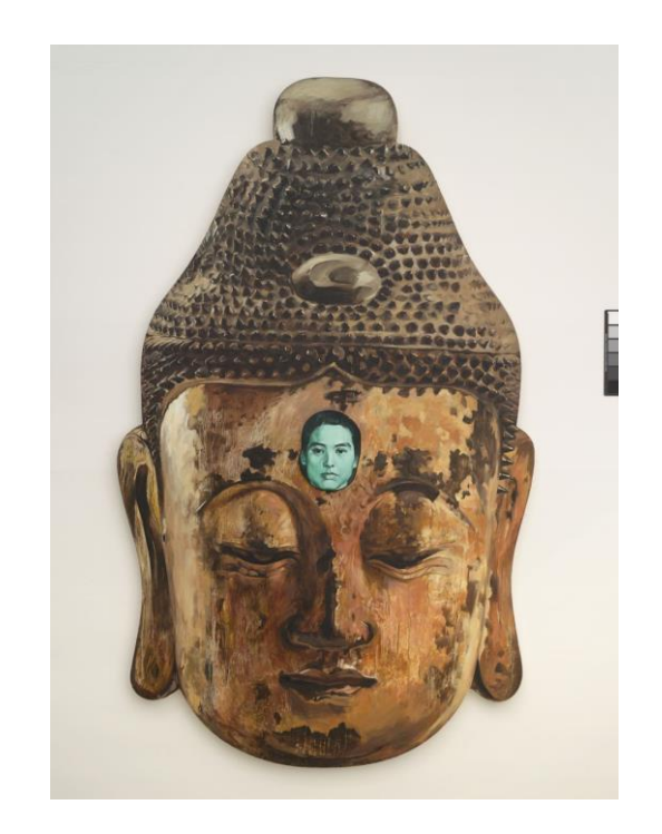
Figure 5. Hung Liu, A Third Eye, 1993. Oil on canvas and inset wood, 91" x 55". Collection of the Kemper Museum of Contemporary Art, Kansas City, MO. Courtesy of the artist.

Two other works, Still Life (1991) and Golden Lotus/Red Shoe (1990), which I have only seen in reproductions, extend the range of Liu's political work. The former, a diptych, references Tiananmen Square of 1989, depicting a single figure with his back towards us, facing a row of seated Communist soldiers, and a market scene below with a display of a row of slaughtered chickens. The latter is more complex, pairing a prostitute with bound feet and a female Red soldier with a rifle striking a militant pose. To the left of the latter figure is a copy of a small photograph of Liu during military training, in a uniform and holding an automatic rifle, taken during her college days in the early 1970s.<sup>37</sup> Social and political dominance over women unites these three images. At the same time, the female soldier and Liu in uniform are a far cry from the woman whom traditional foot binding has rendered immobile.