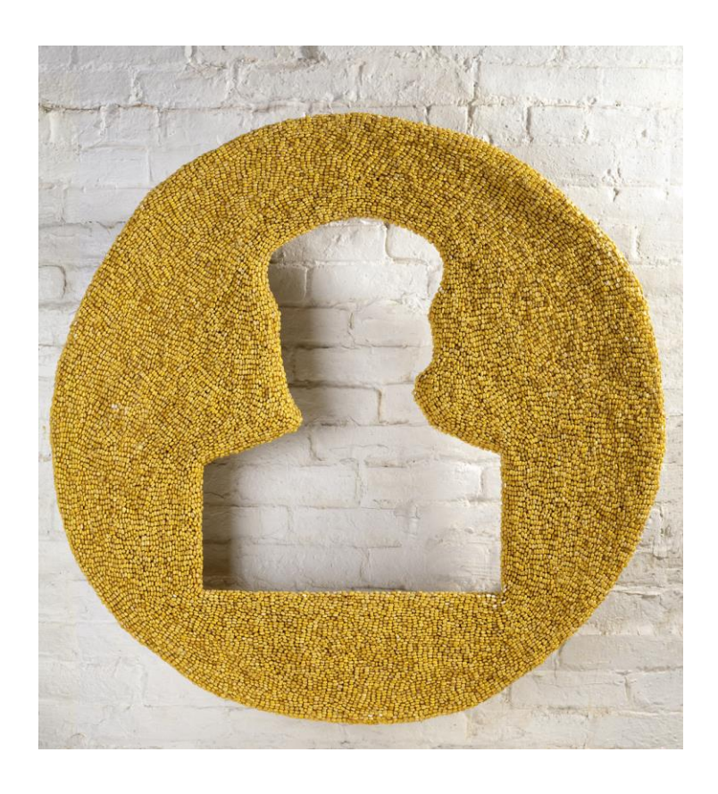
Figure 9. Zhang Hongtu, Corn Mao, from the Material Mao Series, 1992. Corn kernels on plywood, 39" in diameter.