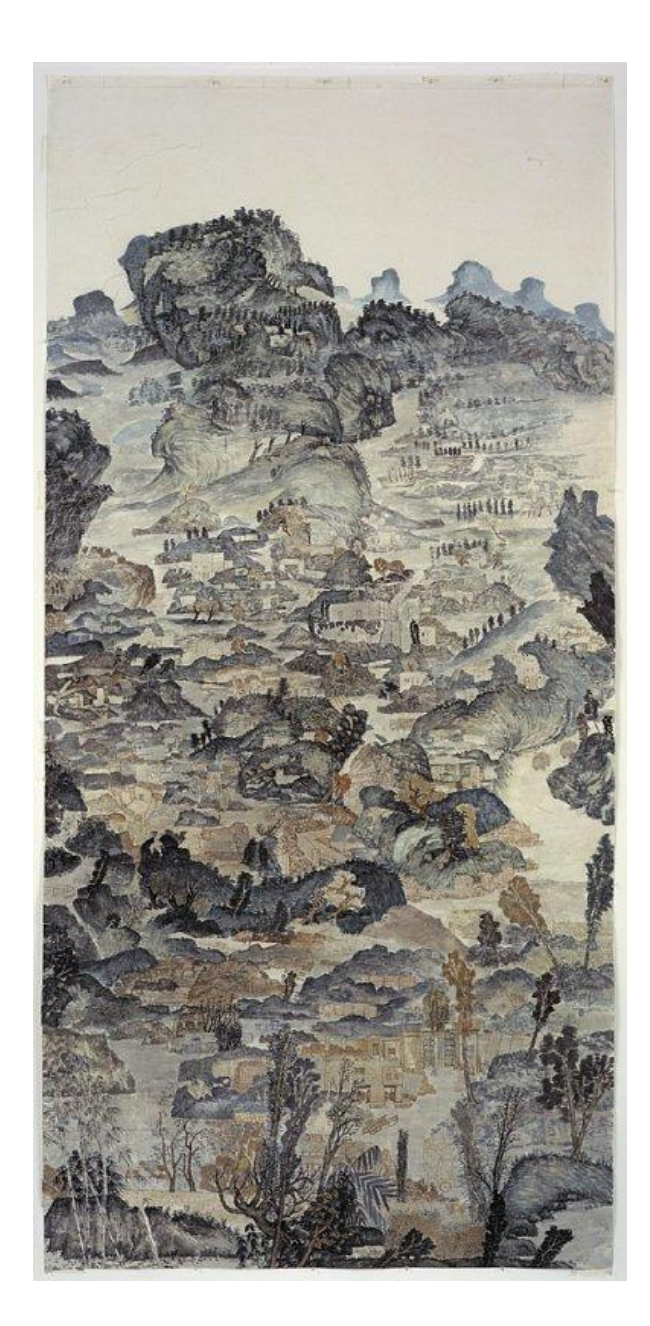
Figure 3. Yun-Fei Ji, Below the 143 Meter Watermark, 2006. Mineral pigments and ink on mulberry paper, 118½" x 56½". Copyright Yun-Fei Ji. Courtesy of the James Cohan Gallery, New York.

The 10-foot scroll The Three Gorges Dam Migration is an artist's book hand-printed in China in 2008–2009 from five hundred carved woodblocks—the technique over a thousand years old—made by Rongbaozhai, one of China's most famous printers and publishers. It is the seventh book commissioned by the Library Council of the Museum of Modern Art in New York, a joint project of the publishing house and the museum. In a 2010 exhibition at the James Cohan Gallery in New York titled Mistaking Each Other for Ghosts , <sup>24</sup> Ji showed this work alongside ones he had made in the eight months he spent in Beijing while the scroll was being printed. His figural drawing style has always been indebted to the socialist realism he learned in China; however, in many drawings and finished watercolors from the Beijing trip, Ji overtly emphasizes the socialist realist approach and forgoes the skeletal renditions of ghosts