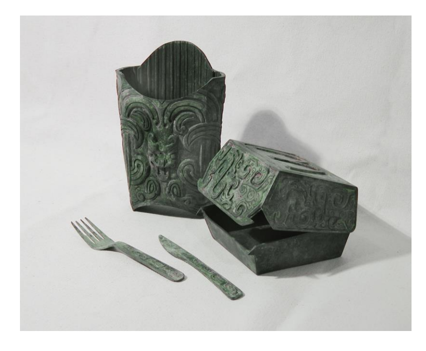
Figure 10. Zhang Hongtu, Mai Dang Lao, 2002. Cast bronze, actual size. Courtesy of the artist.

house as the institutional framework of the global art market responsible for hyping the latest fad and reducing cultural items to monetary values. The catalogue works are visually intriguing and conceptually clever, in keeping with Political Pop and cynical realism being produced by contemporary artists in China in the 1990s. However, Zhang is more overtly political as he critiques both capitalism and the Chinese government. He is also less interested in appropriating the signs of American Pop art often included in works by artists in that movement in China.