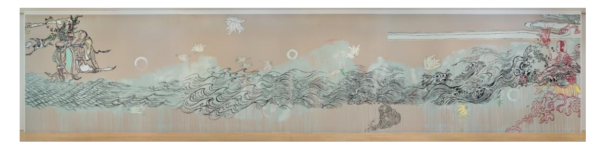
Figure 8. Hung Liu, Silver River, site specific May 2013. Gallery-length mural (disappeared September 29, 2013), acrylic on drywall. San Jose Museum of Art. Courtesy of the artist.

In 2013 Hung Liu was celebrated with retrospective exhibitions at the Oakland Museum of California and Mills College in Oakland. Recent works were part of the exhibition Questions from the Sky: New Work by Hung Liu at the San Jose Museum of Art. New modes of working are revealed in two paintings that are performance pieces. In Silver River, Liu spent a week in the museum creating a gallery-length painting of "ghost" flowers and undulating calligraphic drawings and her signature drips. In Four Cantos, she painted an abstract work in front of the audience, inspired by a simultaneous video projection of a film of revolutionary movies she saw when she was