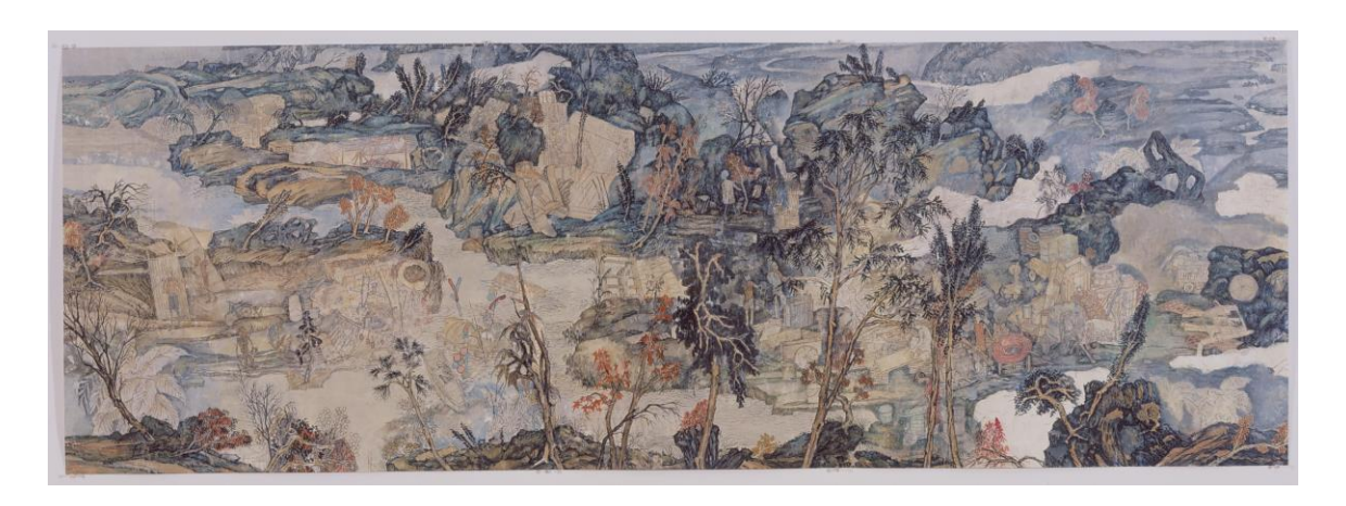
Figure 1. Yun-Fei Ji, The Empty City: Autumn Colors, 2003. Mineral pigment on Xuan paper, 31½" x 92½". The Judith Rothschild Foundation Contemporary Drawings Collection Gift, Museum of Modern Art, New York. Copyright Yun-Fei Ji.

Upon first perusing Ji's ink wash and mineral pigment paintings on handmade paper in catalogue form, I not only wanted to engage the originals but was also prompted to add a cruise on the Yangtze River to see the Three Gorges Dam project on my trip to China in 2008. After I returned, the first painting of his that I actually saw, The Empty City: Autumn Colors (2003) was on exhibition at MoMA in New York (see Figure 1).<sup>12</sup> I was engaged by the work on many levels: the delicacy of the watercolor; the complex brushwork and allegiance to classical landscape painting; and in particular the content that imaged the devastation to land and people brought about by the Three Gorges Dam project—in the name of economic and industrial progress.